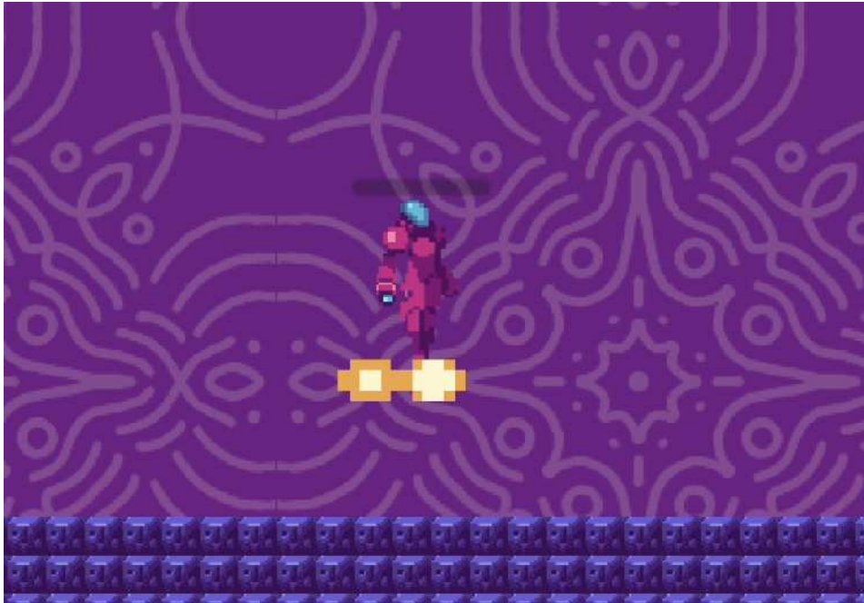
Figure 3: A player riding their own bullet

and letting the players decide their goals created a space where the structure of a game can be appropriated as a tool to build and play through creating their own goals and metagames.