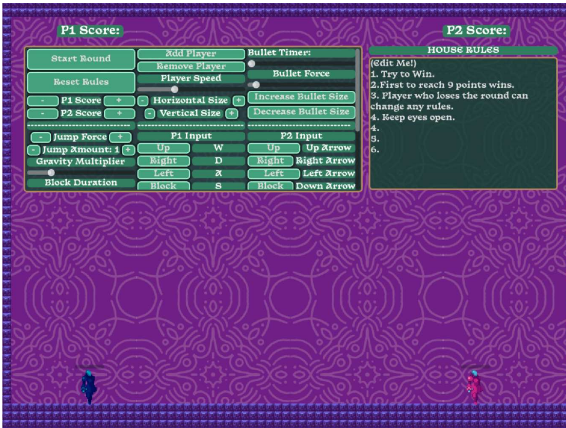
Figure 2: A screenshot of ‘Player Discretion is Advised’ with implemented features. The digital rule deck it on the left hand side, and the house rules on the right. Each player could interact with these at the start of each round. Once the round began, player 1 controlled the blue avatar, and player 2 the pink avatar.

their implicit internal rules, was developed through an iterative process. As the game itself presented a structure which was open to change in an untraditional manner, the playtests were often a surprise to both me and the players, and it prompted reflections about strategies to give players the freedom to invent their own play-practices through engaging with the rules of a game on a transformative level. In the next section, we present three design themes which summarize our findings from the research through design process of this game.