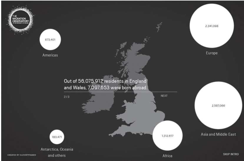
Figure 24.2: Migration in the census.

some participants trusted migration visualizations which carried the logo of the University of Oxford, because they felt that the “brand” of this university invokes quality and authority. But during the diary-keeping period, a different picture emerged. Participants tended to see visualizations in their favoured media, which they trusted, so they were likely to trust the visualizations they saw there, too. One participant (male, 24, White, British, agricultural worker), who reads The Daily Mail , demonstrated this when he remarked in his interview that “you see more things wrong or printed wrong in The Sun , I think.” Given the ideological similarities between these two publications, this comment points to the importance of media location in dataviz engagement.