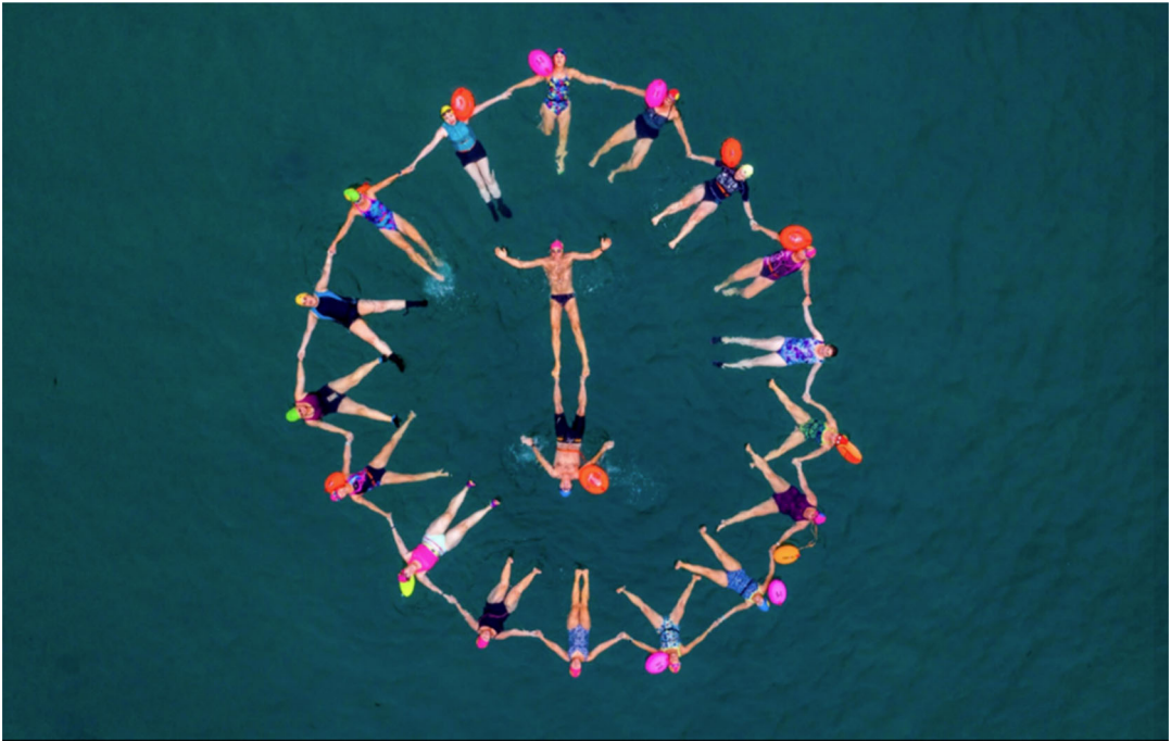
Figure 8. Aerial self-portraits in drone photography.

This brings about a sense of empowerment as the individuals “hijack surveillance” (Jablonowski 2017, 103) and retain certain agency in the face of the aerial gaze. Although people are the focus of the image, the drone is more concerned with capturing the patterns that they make rather than the individuals themselves. In other words, cinematic views are foregrounded with the camera ascending away from the people in a zoom-out effect. This means that little attention is paid to the gestures, facial expressions, and appearance of the depicted people, which reverses the relationship between humans and their surroundings found in typical selfies. These aesthetics also disrupt our understanding of traditional image acts and gaze because the participants do not form “vectors” (i.e. eyelines) with the viewer, nor do they “offer” or “demand” anything or carry out material actions (Kress and van Leeuwen 2006, 117); rather, they are turned into abstract still life images with a dense, three-dimensional sense. This