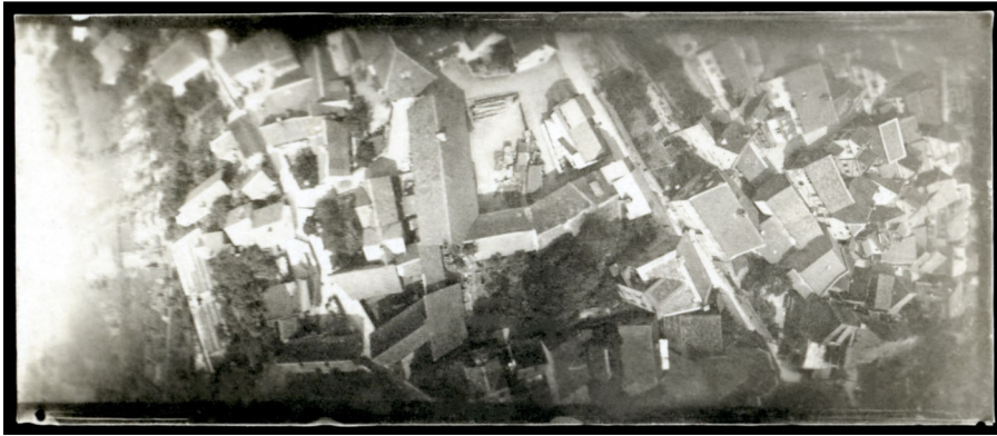
Figure 3. Verticality in pigeon photography.

Details on the tops of buildings that may never be engaged with directly in real life – tiles, window-panes, generators – are presented close-up, encouraging textural engagement with their metal, ceramic, and glass (Ledin and Machin 2018, 157). Through the top-down angle, a “personalized aerial space” (Hildebrand 2019a, 399) is fostered that not only distorts our typical understanding of cityscapes and expands human vision, but challenges us to remake our existing relationship with our geographical surroundings. Thus, here, subject and object are not in opposition to one another, but rather merge to become a “conjoined machine of seeing” (Maurer 2021, 31).