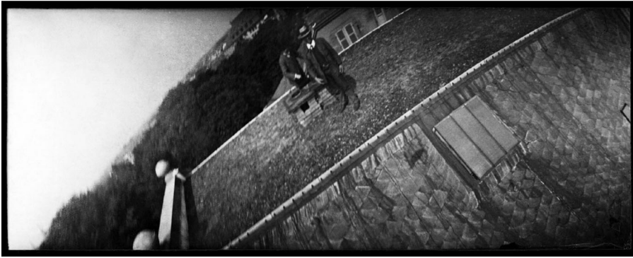
Figure 9. Aerial self-portraits in pigeon photography.