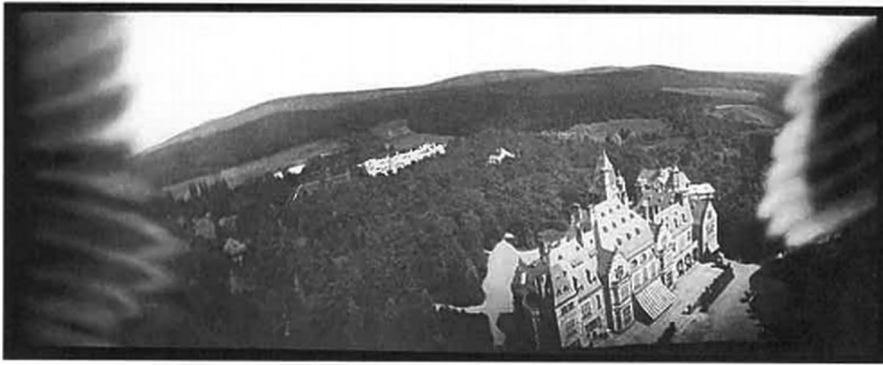
Figure 7. Access to inaccessible places in pigeon photography.

what we see does not actually represent what the pigeon sees because the camera is strapped to its breast, not its head. Therefore, our image can only ever be an imaginary as the pigeon's wings accentuate its position in a reality of which we can never really be part due to our inability to fly (Wilkinson 2013, 10). In this way, the pigeon's view never represents one truth, but rather certain things, places, and ideas that are always partially bound in fantasy (Ledin and Machin 2020, 65). Other photos in the same series show close-ups of the palace, indicating how the pigeon successfully navigates the private gardens in the guise of an innocent bird rather than a surveilling apparatus. In doing so, it makes visible structures of power (i.e. the royal family) that typically operate through invisibility, thereby reversing the gaze in a symbolic sense or, as Paglen states, turning "the masters of surveillance" into the "surveilled" (cited in Wilkinson 2013, 12).