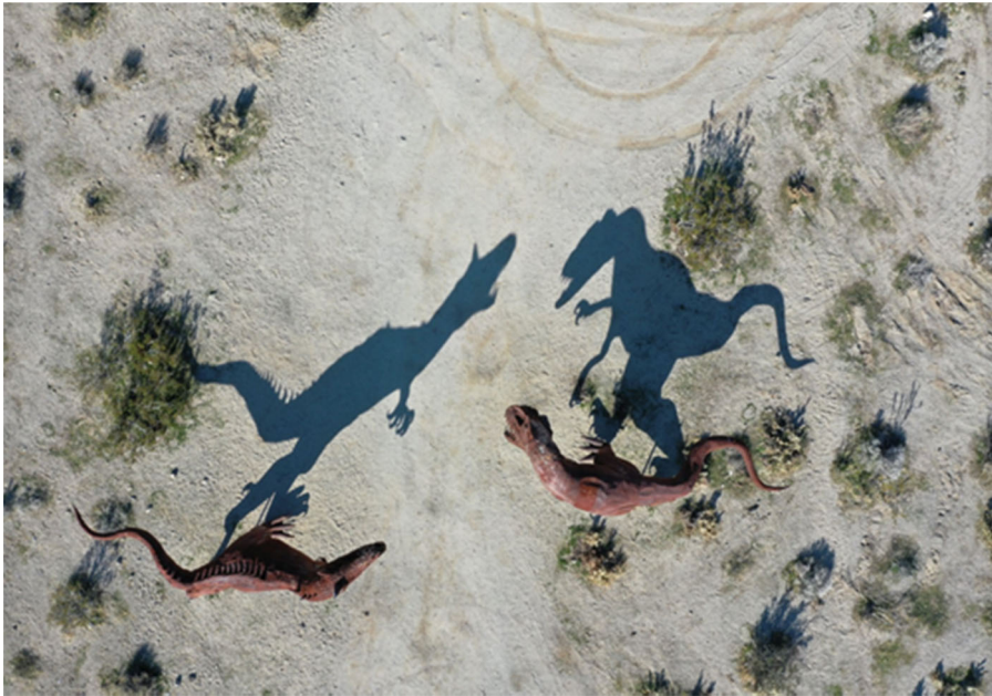
Figure 4. Geographical reimaginings in drone photography.

conditions: the effects of sun, wind, rain, or snow can alter the way we see a landscape and even transform seemingly mundane views into spectacular sights. In other cases, these reimaginings are the result of tricks of light or shadow play, which can change tones and perspectives, thereby transforming viewers' emotions as they are exposed to subtle details of a site's geography. In others still, it is the framing or angle that can confuse our sense of spatial orientation and, therefore, thrust us into an atmospheric space in which we struggle to orient ourselves and must search for what is held within the image (Wilkinson 2013, 11).