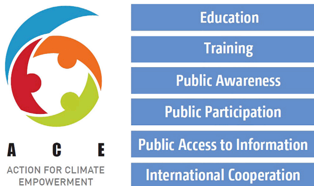
Figure 2. Diagram Depicting the Six Elements of Action for Climate Empowerment (Article 6 of the UNFCCC Convention)

Reprinted from United Nations Framework Convention on Climate Change, 2020 .