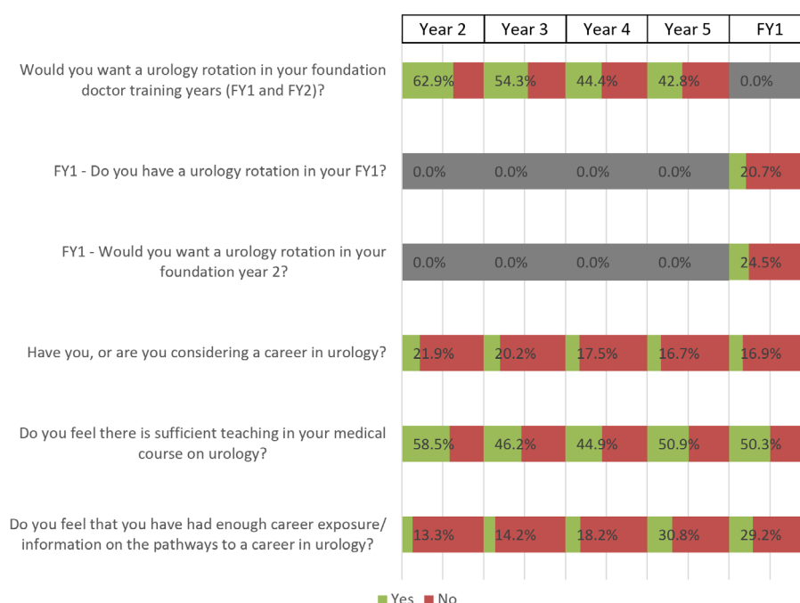
Fig. 3 Postgraduate career and exposure, stratified by year group. Percentage (%) corresponds to the 'Yes' value.

17.3% of all Year 2 to Year 5 medical students and FY1 doctors collectively (7063/40 927). In addition, representation was achieved across all 39 eligible UK medical schools. This enabled us to capture the heterogeneity in placement exposure, both across and within UK medical schools. To our knowledge, this is the largest study on specialty-specific undergraduate teaching. We did not find any comparable large-scale evidence on urology education during medical school in other countries. This makes the LEARN the only study worldwide to investigate this and serves as a good baseline for other countries to investigate their undergraduate urology exposure. Additionally, there was no strong evidence to suggest significant variation in results between medical schools based on the number of responses (Fig. S18). Medical schools with a greater number of responses tended to fall within a reasonable difference to the national average, whilst medical schools with a lower number of responses were at risk of over-estimating urological exposure.