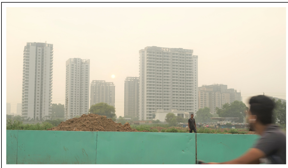
Figure 4. Inhabiting material incompleteness in the extensions of Delhi.

One way to consider these questions of futurity – of what kind of time is embodied in extensions – is not only to consider the kinds of infrastructures generating and supporting extensions, but also to see extensions themselves as an infrastructural form.