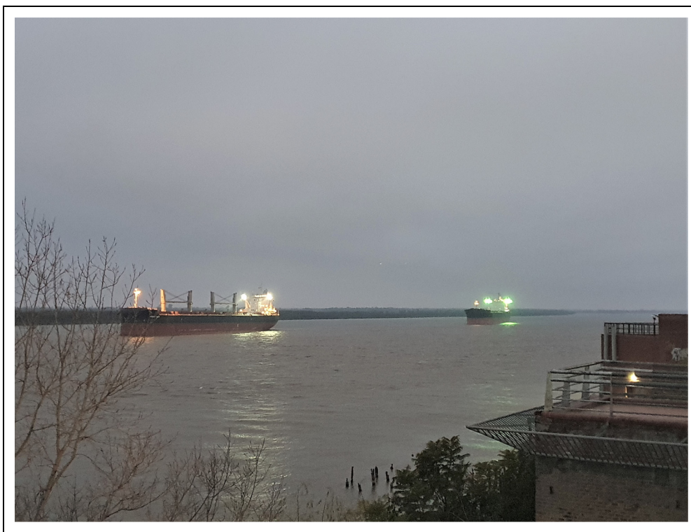
Figure 3. Paraguay-Paraná waterway, Rosario.

What kind of time (Adam, 2004) is embodied in the space(s) of extension, if we look at the material infrastructures that swiftly re-organize it? Of course, this is not a matter of finding a different ethic within