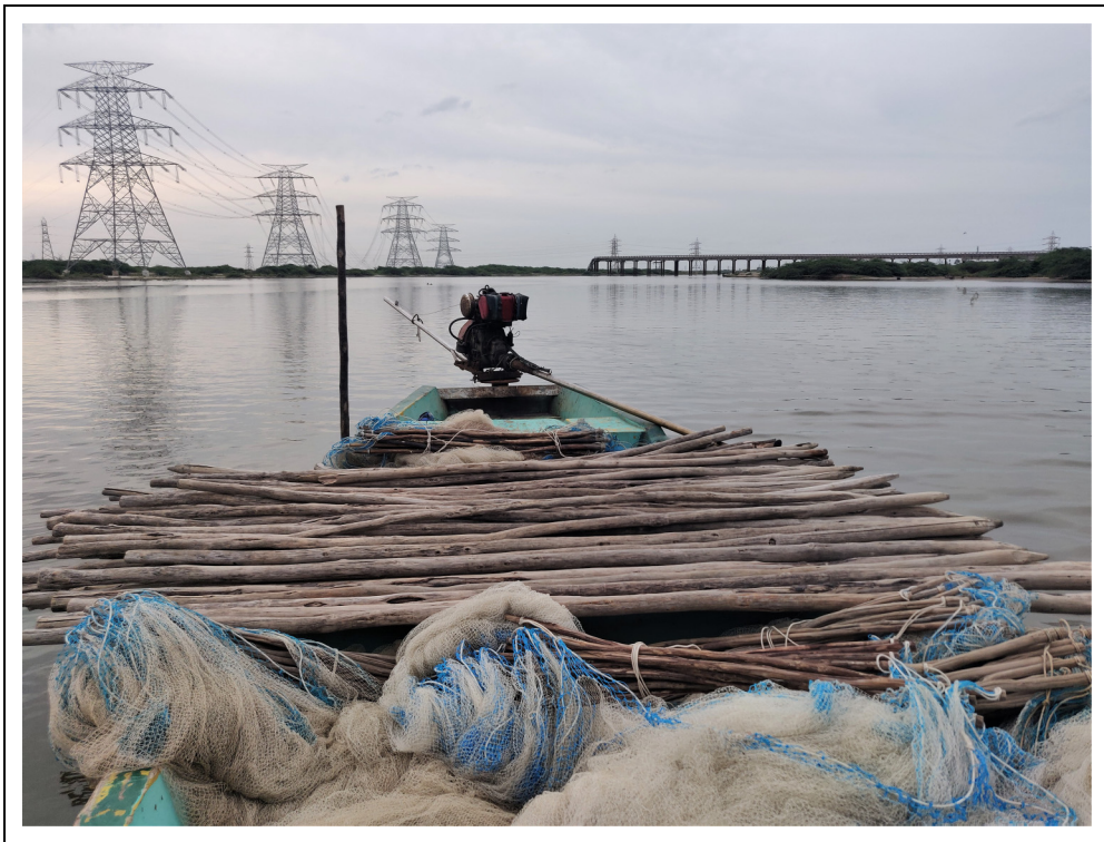
Figure 2. Urban life in the waterways of North Chennai.

Yet, it is the north Chennai wetlands, coastal sands, canal and riverbanks that are seen as ‘marginal’, and in need of urbanization of a certain kind, inhabited as they are by working classes, lowered castes and fishers, always before and in order to labour towards the building of the city proper. When life in these watery geographies gets folded into an analysis of extended urbanization (Couling, 2018), it ends up reifying existing frontier logics. The environments themselves are analysed only in subordination to dominant urbanization – either as nature that is urbanized or as urbanization that pushes into marginalized natures. However, as recent scholarship in urban political ecology has argued, a move beyond the ‘urbanization of