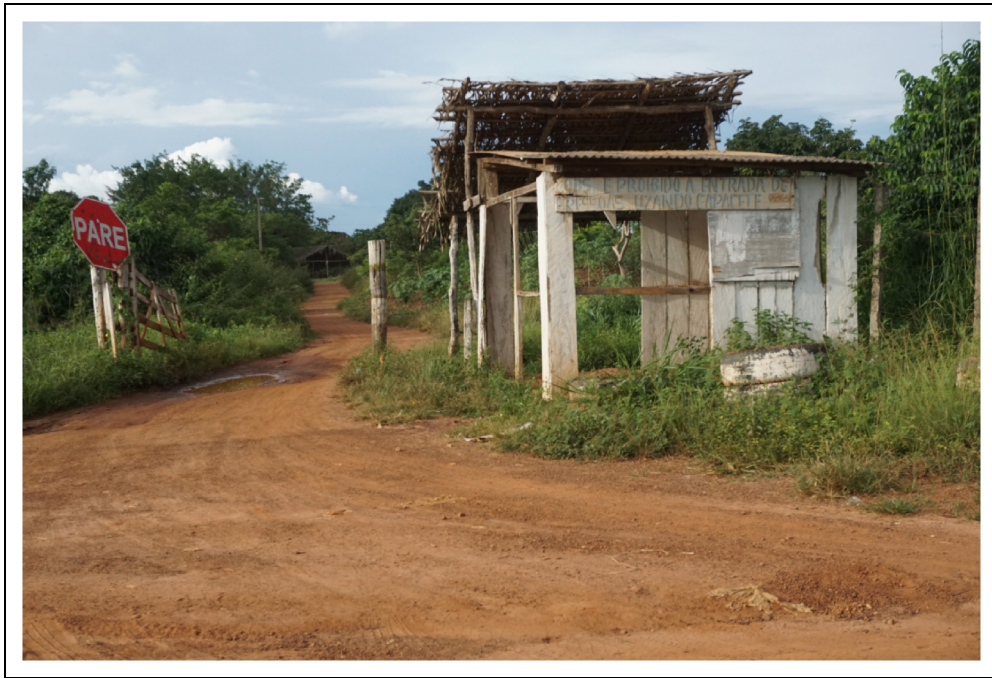
Figure 1. ‘Entrance is forbidden for people wearing helmets’, Serra Dourada Landless Encampment in Canaã dos Carajás, Eastern Amazonia – Rodrigo Castriota.