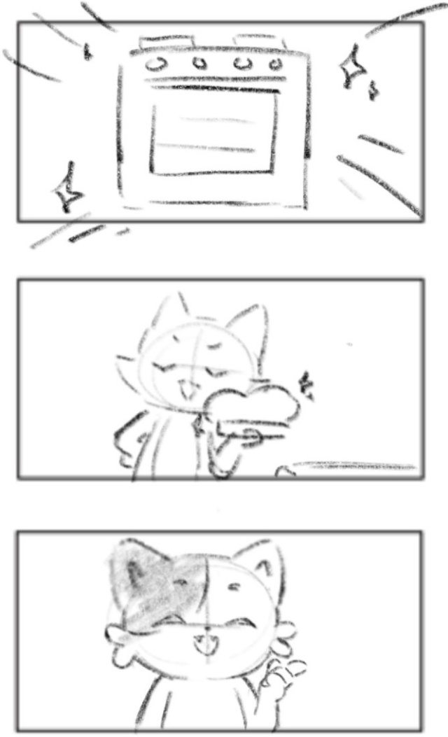
Fig. 4. Extract from the storyboard of the first video.

It is interesting to notice the mindset of the two cats (from left to right, and top to bottom):