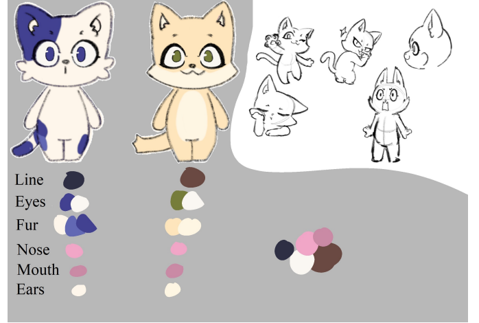
Fig. 2. Character Design.

Fig. 2, with a particular focus on the line types and colors, together with an example of animation. The reader will notice that one cat has some blue-ink spots, expressing its affinity for science. The eyes expression of the orange cat illustrates its passion for learning and the star-shape of its tail tip open the perspective of a bright future in science for this young cat.