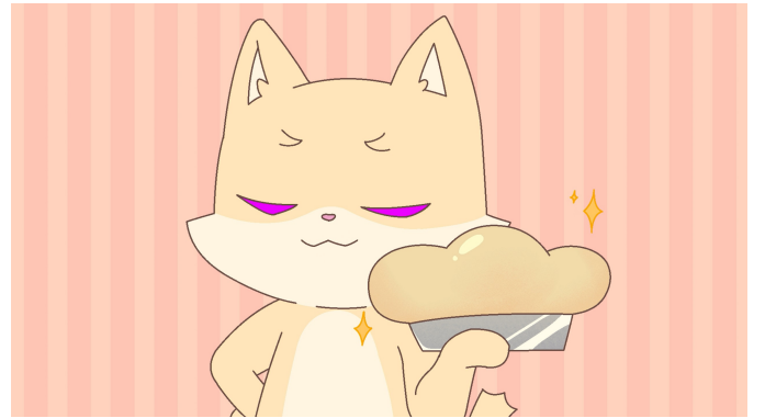
Fig. 6. Example of one frame colored picture.