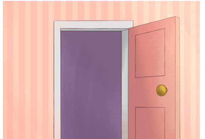
Fig. 3. Example of background.

Several backgrounds are used during the videos, some indoor, other outdoor, during different day moments. One example of background is presented in Fig. 3: the open door invites one character to join the other one into the considered scenario.