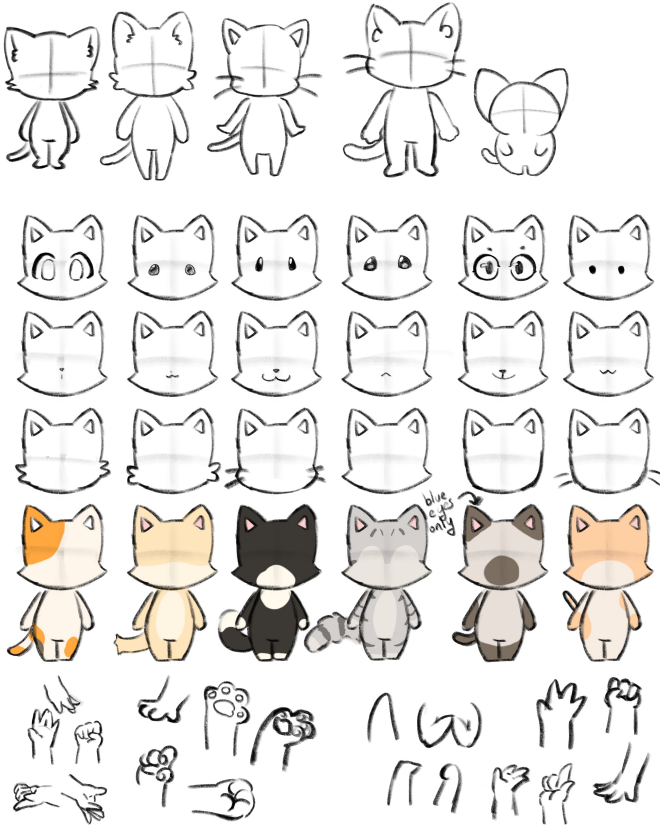
Fig. 1. First drawing tests for the characters.

The 2D animator proposed several types of cats (see Fig. 1) with different simplified shapes for the body, head, paws, and different colors. All these elements define somehow the artist's signature. Once the global shape of the cats was selected by the project members, the cats were fine-tuned by the 2D animator. Therefore, a similar shape is used for the bodies of the cats, but with different fur color, eyes shape and color, nose and mouth shape, etc. The selected version of the Character Design is illustrated in