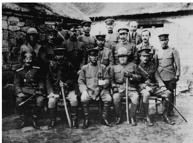
Zumoto (back row, first from the right) with foreign military observers and Lieutenant General Mitsuomi Kamio (first row center?) in Tsingtao in 1915 84 .

It is also apparent from photographic evidence that Zumoto accompanied the Japanese and British allied forces in the 1914 siege of Tsingtao.