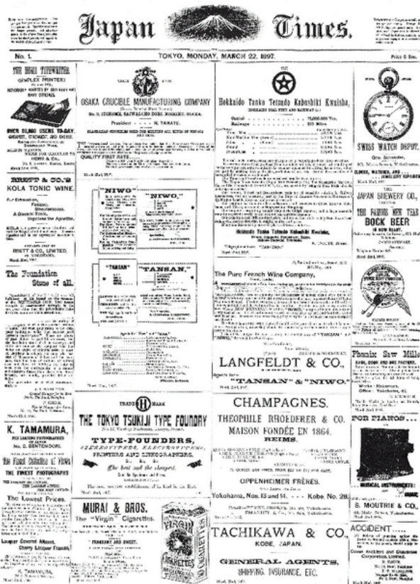
The front cover of the inaugural issue of The Japan Times , 22nd March 1897 53