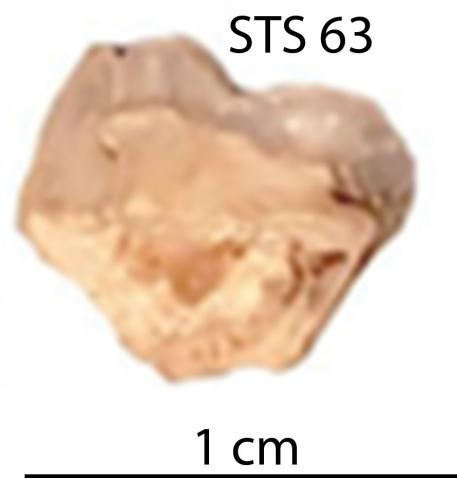
Figure 1: The analysed Sts 63 molar fragment (no orientation could be identified).

Chiral amino acid analysis was undertaken on enamel ( \pm 5 mg) from Sts 63 following the protocols of Dickinson et al. 28 After bleaching, the specimen was divided into two fractions: one for determining free amino acids (FAA) and one for quantification of the total hydrolysable amino acids (THAA). The concentration of the intra-crystalline