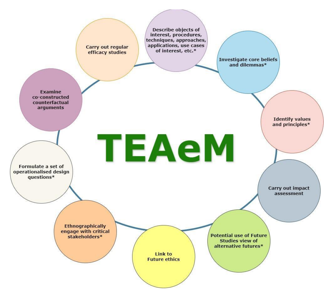
Figure 3 . The TechEthos Anticipatory ethics Model (TEAeM), (please note *elements taken directly from ATE plus)

A further explanation of the various elements that comprise the TEAeM framework are presented below in Table 1. This provides the starting points or relevant questions that could be asked in each of the model elements. As has been noted above, although TEAeM is presented in a tabular format in Table 1, and could be carried out in this way, it is intended that this is a flexible approach, that is responsive to the needs for specific emerging technology under scrutiny, and so the steps can be returned to, or the order adjusted as and when needed. In this way, the steps shown below could be a useful order in which to proceed, but there is flexibility allowed for reordering, depending on the specific context.