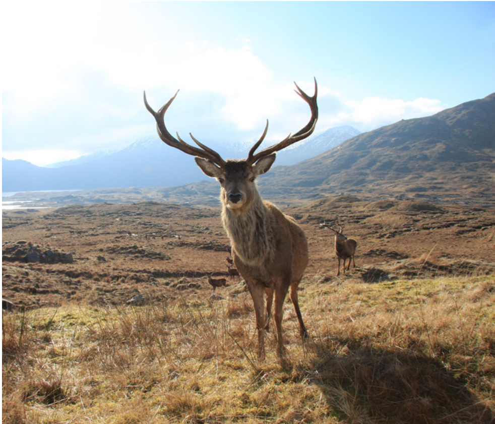
Figure 2. Red deer.

quoting Cummins (1988: 41): ‘There was a recognised way of doing everything: formulaic cries, commands and horn-calls; ritualised ceremonies. The most striking imposition of ceremonial and activities [...] came after the death, in the flaying and butchering (“unmaking” [...]) of the animal.’ Cummins’ account of this unmaking is based on textual and iconographic sources, the latter relying especially on the pictorial representations included in Le livre de chasse de Gaston Phébus (late fourteenth century, south-western France). This includes key images of the hart held on its back while butchered and skinned (BNF, MS. fr 616, fol. 85). A similar image is also represented in the approximately contemporary Livre du roy Modus