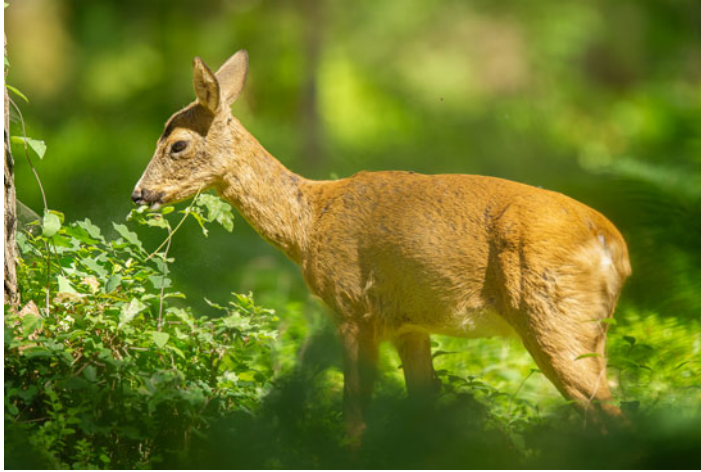
Figure 4. Roe deer.

cerf is only slightly later (c. 1250); it also describes the formulaic breaking-up of the deer carcass (Almond, 2011: 64). English sources are later and tend to plagiarize earlier French sources such Phébus . The Art of Hunting (1327) by William Twiti (MacGregor, 2012: 114) predates Phébus but was originally written in Norman French, thus betraying its geographic area of inspiration. Other well-known English hunting treatises, i.e. the Master of Game , the Tretyse off Huntynge , the Boke of St Albans , and the Noble Art of Venerie , date from the fifteenth and sixteenth centuries and do not provide much original information concerning the practice of unmaking (cf. Cummins, 1988: 41–43; Almond, 2011: 75–76; MacGregor, 2012: 114–15). There are also French literary sources that are later than Phébus and Henri de Ferrières, such as Jacques de Brézé's La chasse , which adds variations to the instructions in Le livre de chasse (Cummins, 1988: 41). Brézé was the sénéchal (bailiff) of Normandy, indicating that at the very latest by the late fifteenth century (but probably a lot earlier) the unmaking of deer was a well-established practice in that region.