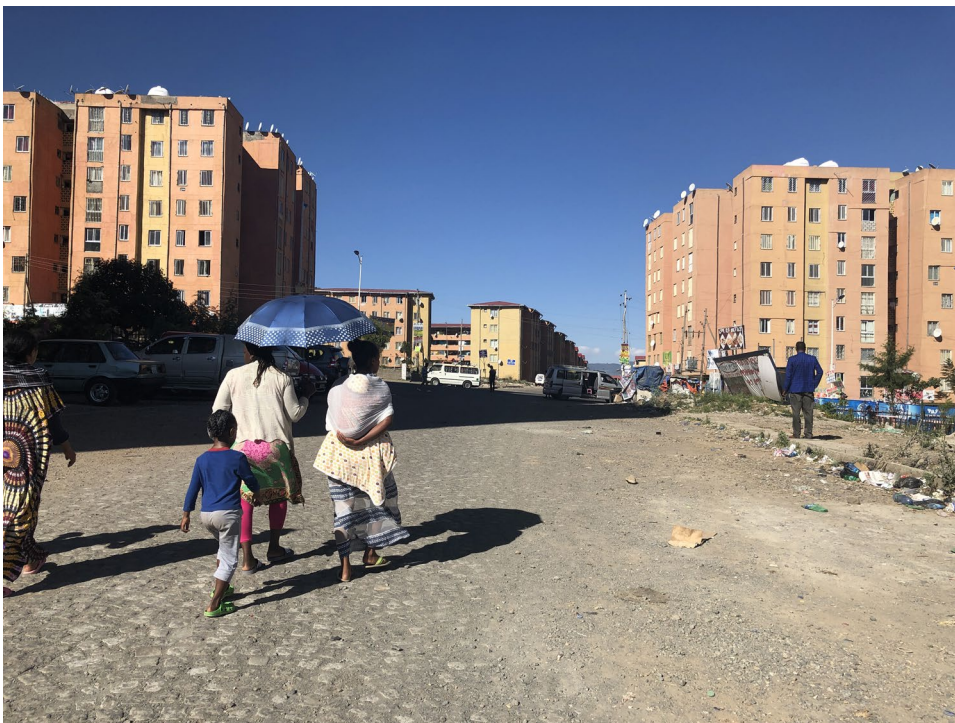
Figure 3. Street views in Yeka Abado.