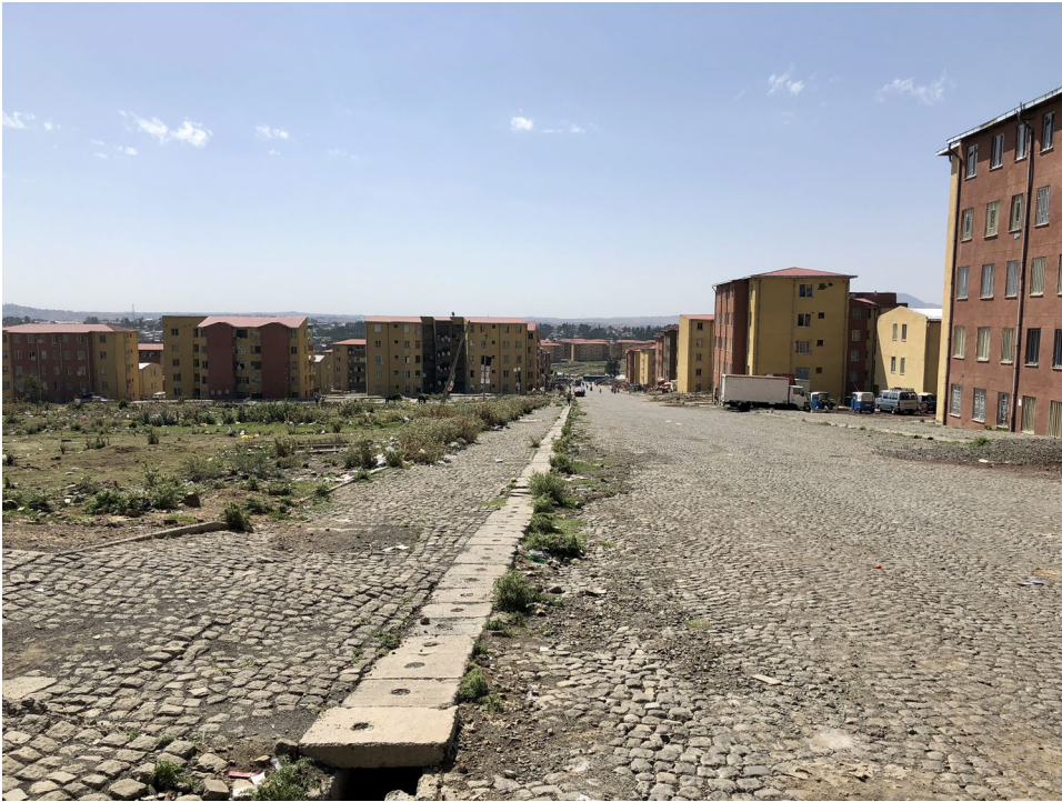
Figure 4. View from a high vantage point over the IHDP housings in Yeka Abado.

infrastructure, and perspectives on living conditions. In the analysis, we refer to interviews and diaries from Tulu Dimtu as ‘TD’ and those from Yeka Abado as ‘YA,’ in each case followed by the relevant number.