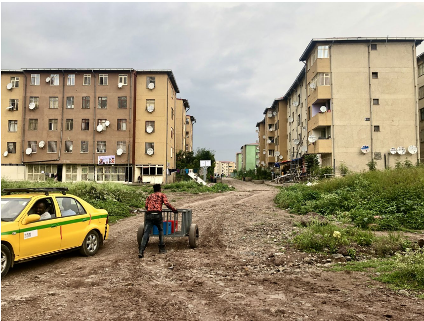
Figure 2. IHDP condominiums in Tulu Dimtu.