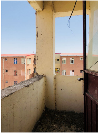
Figure 5. An unfinished balcony in a condo unit in Tulu Dimtu.

the program began with the provision of cheaper units featuring a 10–90 payment model, it quickly expanded to include predominantly 20–80 and 40–60 models targeted at middle-income groups, often with higher interest rates.