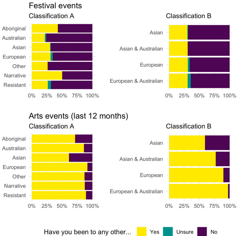
Figure 2. Attendance at other festival events, and other arts events, by different categories of cultural background.

In this case, the “Asian”, “Resistant”, and “Narrative” group are the most distinct. Every single member of the “Narrative” group would attend an event like this again; the “Resistant” and “Asian” groups have the largest fraction of people who aren’t sure.