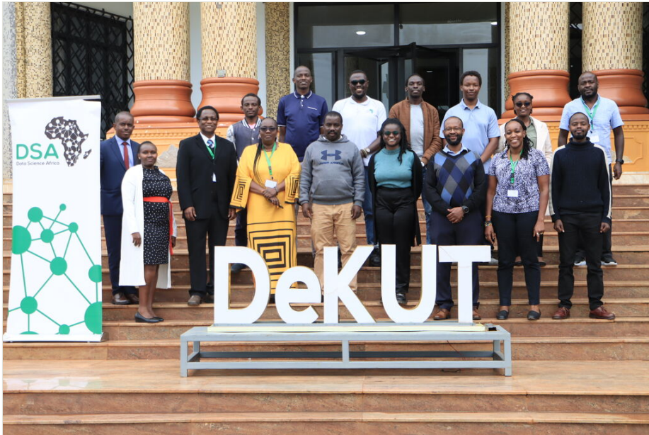
Figure 7. doi

A group photo of participants who physically attended the workshop.