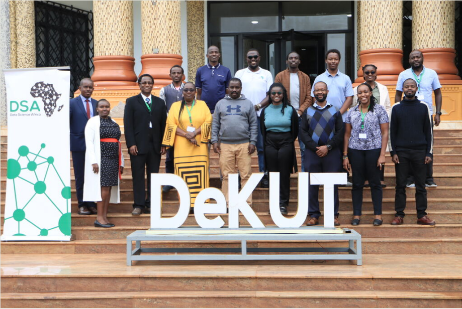
Figure 7. doi A group photo of participants who physically attended the workshop.

We would like to thank all of the workshop speakers and participants, both in person and online, for devoting their time and providing valuable insights into this discussion. This workshop would not have been possible without the support of DSAIL, GeJuSTA, DeKUT and DSA.