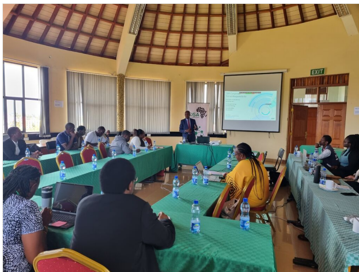
Figure 4. doi

Mr. Matogo from IBM giving an overview of their digital learning platform.