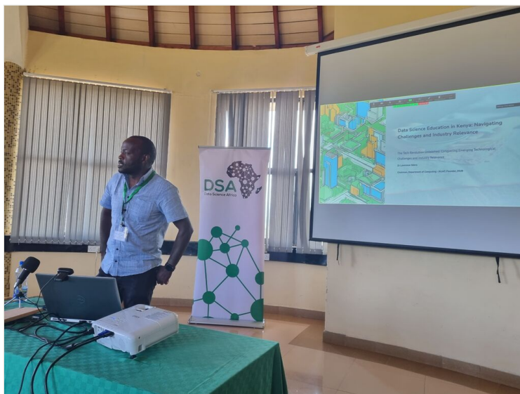
Figure 3. doi

participants with an in-depth overview of IBM SkillsBuild, a free digital learning programme that assists people in developing skills and gaining access to career opportunities in AI, data analytics, software engineering, cloud computing and soft skills (Fig. 4).