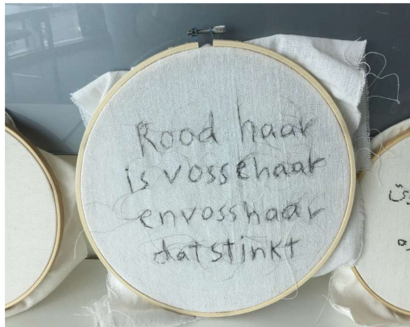
Embroidered hair

languages; the artworks place women's hair expressly 'out of place' and their framing and display in public spaces speak taboos.