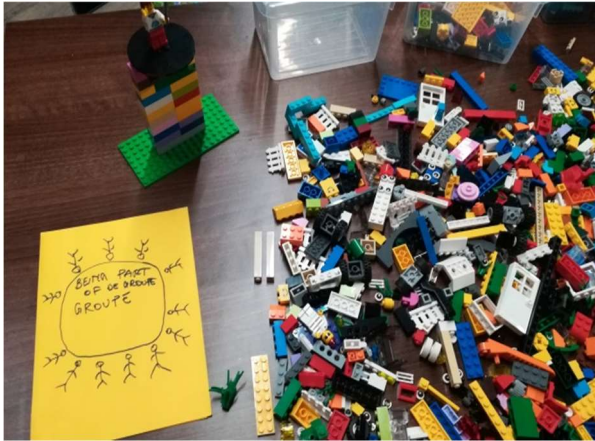
Our scattered Lego bundle

Offering themselves as unwrapped presents.