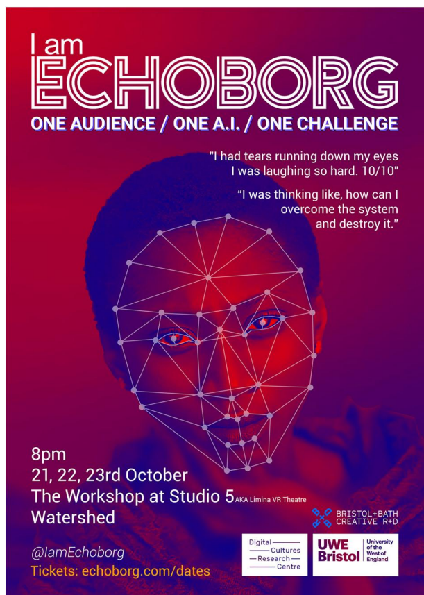
FIGURE 1 Poster for I am Echoborg events used in this study

aid in medical applications, such as helping health care workers arrive at better diagnoses. However, most comments pointed to the fears of AI in skewing democratic processes, 'state invasion of privacy', and deep fakes and in the exclusion of certain social groups. These comments suggested the audience's apprehension of AI's potential to manipulate behaviour and social processes. In response to