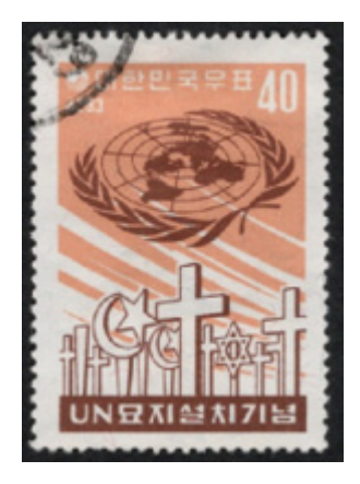
Figure 24. United Nations Korean War cemetery, 1960.