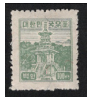
Figure 1. Tabo-t'ap pagoda, Kyŏngju, definitive stamp, 1949.

The next largest category of images in the subject area of cultural history was the 'religious' aspects of folklore, accounting for 66 images or 41 percent. Again the use of imagery of this type appears very early. On 1 April 1951, less than three years after the founding of the state and during the middle of the Korean War (1950–1953), South Korea issued a definitive series of stamps that included issues depicting two folkloric animals, the irwŏl-hak (日月鶴, Sun-Moon Crane) and the Paekho (白虎, White Tiger), SK 72 and SK 73 (Figures 2 and 3). Subsequent issues had images depicting spirits on the ends of roof tiles, folkloric animals in paintings or adorning objects, such as poles, as well as performance images, such as shamanic dancers and shamanic ceremonies in modern art. A repeating folkloric image is of the Sip changsaeng (十長生, Ten Symbols of Longevity; Pratt and Rutt 1999, p. 273). Although these ten symbols are common to all of the nations of East Asia, the Korean tradition has been to place them all together within a single work of art, often