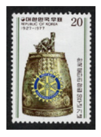
Figure 19. Korean Rotary Clubs' fiftieth anniversary, 1977.