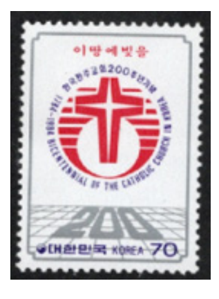
Figure 15. Korean Catholic bicentennial, 1984.