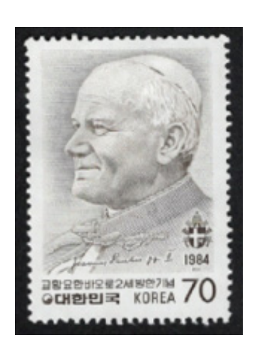
Figure 16. Visit of Pope John Paul II to Korea, 1984.