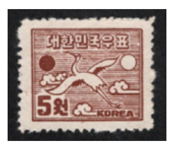
Figure 2. Irwol-hak, definitive stamp, 1951.

as the scene on a multi-panel screen. In 1980, the ROK issued four stamps (SK 1213-1216, Figure 4) on this theme, which was repeated again in 1989 (SK 1585) for World Environment Day and again on 16 August 1994 in a set of eight stamps for the world stamp exhibition PhilaKorea 1994 (SK 1791–1797). The date of issue is significant, as August 15 is the date in 1945 when Japan surrendered to the Allied forces. The date is celebrated each year as national Liberation Day ( Haebang-ŭi nal , 解放 의 날) and often has had a commemorative stamp issued on or around that date. The most recent issue on the Sip changsaeng motif was a minisheet from 30 March 2023 (SK 3639–3654).