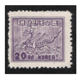
Figure 3. Paek ho, definitive stamp, 1951.