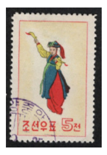
Figure 10. Dancing mudang (shaman), 1960.