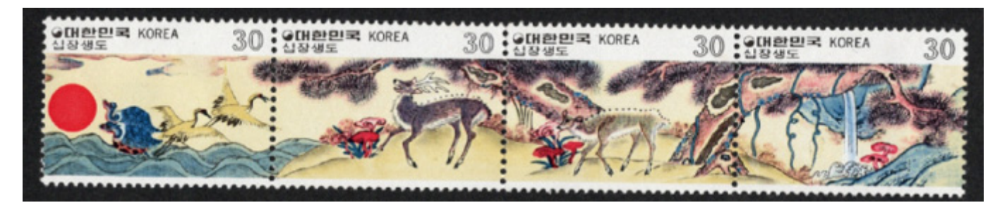
Figure 4. Sip Changsaeng, 1980.

One of the most significant types of folkloric material used in the promotion of cultural history has been the depiction of the foundation myths to illustrate the origins of the Korean people and the Korean state. One of the earliest references to the Myth of Tan'gun (檀君), the purported founder of the Korean nation and state, is a depiction of the Mani-san altar, which is claimed to be associated with the historic worship of the national founder, on a stamp from 28 September 1976 (SK 1054, Figure 5). This was for International Tourism Day. The explicit use of foundation myths as descriptions of national cultural history begins in the millennium. On 3 January 2000, the ROK issued a set of five stamps set in a minisheet, one of which (SK 2059) depicted the Mani-san altar and the Samguk yusa (三國遺事, Memorabilia of the Three Kingdoms), which contains the locus clas sicus for the text of the Myth of Tan'gun. Then, from 2008 to 2012, the ROK issued sets of stamps depicting the Myth of Tan'gun (four stamps, SK 2644–2647, Figure 6), the Myth of Kŭmwa (金蛙), founder of the southwestern Kingdom of Paekche (百濟, four stamps, SK