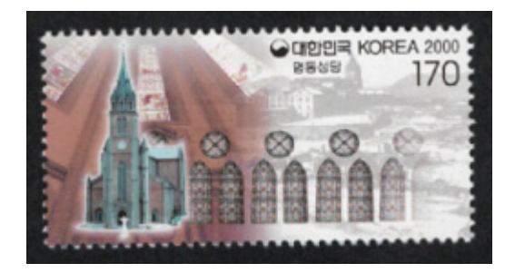
Figure 7. Myŏngdong Cathedral, 2000.

(SK 3576–3579), two of which were early parish churches.<sup>4</sup> These depict the Christian contribution to Korean culture as religious architecture only, and this recognition appears late in the period.