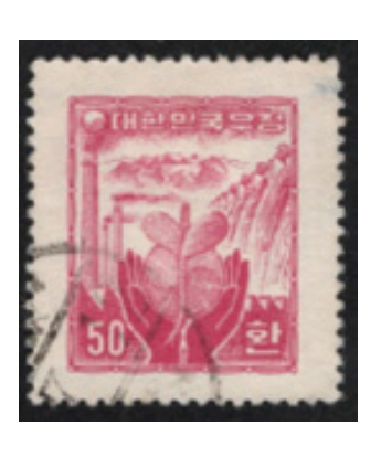
Figure 22. National reconstruction, definitive stamp, 1955.