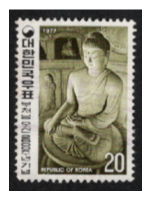
Figure 13. Sökkur-am grotto, Kyŏngju, 1977.