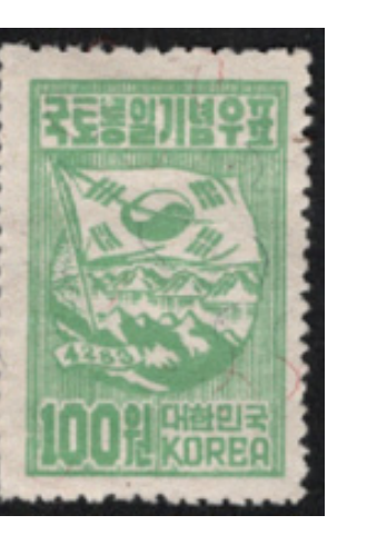
Figure 11 , celebration of national reunification in the Korean War, 1950.