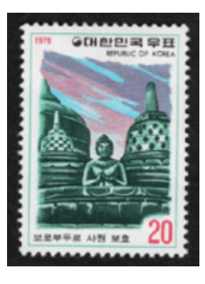
Figure 12. Borobudur temple in Java, 1976.