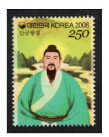
Figure 6. Tan'gun, 2008.

Perhaps the most surprising finding under the category of 'cultural history' was the extremely small number of stamps using Confucian motifs. I have stated that, in my opinion, during the long Chosŏn Dynasty (朝鮮, 1392–1910), Korea became the most Confucianised of all of the nations of East Asia (Grayson 2002, pp. 232–35). Of a total of 209 stamps using 'religious' imagery in the icon, only five had an implicit or explicit Confucian theme. The definitive series of stamps issued during the Korean War period in 1952 and again in 1953 (SK 154, SK 162) showed the image of the memorial shrine to Admiral Yi Sunsin (李舜臣, 1545–1598), who had defeated the Japanese navy in the great sea battle of Hansando (閉山島) in 1598. In the issue in the Sightseeing Series of 1973 (SK 869), the icon consists of a colourful depiction of the Hongsal-mun (紅 살門, Red Arrow Gate) or the ceremonial entrance into the precinct of Yi Sunsin's shrine. These images are depictions of historic Korean architecture, and implicitly both Confucian (ceremonial) and nationalistic (heroic warrior). In the World Heritage Series of 1999, there are two stamps depicting the Chongmyo (宗廟, Royal Ancestral Shrine, SK 2053) and the musicians and instruments used during the royal ancestral ceremony (SK 2054). The Confucian imagery used in the five stamps references 'ceremony' and not ideas or principles.