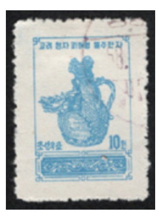
Figure 9. Koryŏ ceramic vessel, 1958.