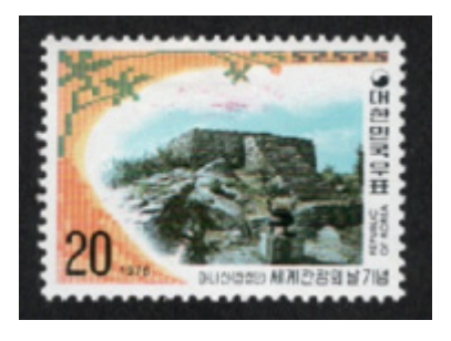
Figure 5. Mani-san altar, 1976.

2783–2786), the Myth of Chumong (朱蒙), founder of the northern Kingdom of Koguryŏ (高句麗, four stamps, SK 2718–2721), the mythic legend of the foundation of the successor state to Koguryŏ, Parhae (渤海, four stamps, SK 2846–2849), and the origin myth of the royal Pak (朴) clan of Silla (新羅, five stamps, SK 2898–2902).