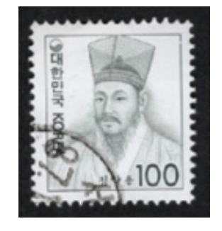
Figure 18. Chŏng Yagyong, definitive stamp, 1986.