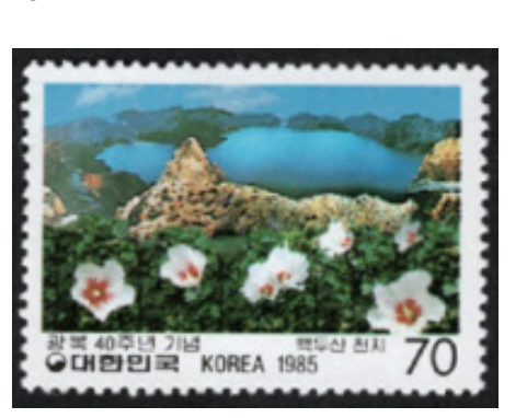
Figure 23. Fortieth anniversary of national liberation from Japanese rule, 1985.