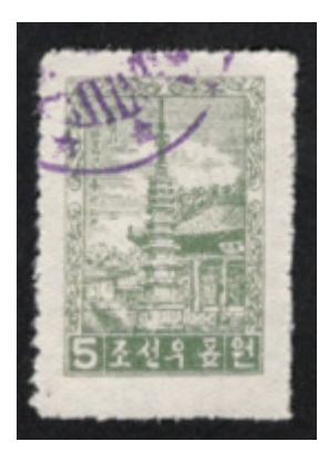
Figure 8. Wŏljŏng-sa temple and pagoda, 1958.

Of a total of 96 North Korean stamps with a cultural history theme issued in the period, only 18 (19 percent) contained Buddhist imagery, and, in some cases, these images were