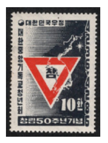
Figure 14. Korean YMCA fiftieth anniversary, 1953.

bered in 1990 (SK 1635), as well as the centenary of the Salvation Army in 2008 (SK 2665). Beyond this, the centenary of the foundation of the Korean Bible Society was celebrated in 1995 (SK 1851) showing an open Bible, and the hosting of the forty-fourth Roman Catholic Eucharistic Conference in Sŏul in 1989 (SK 1600).