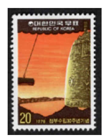
Figure 20. Thirtieth anniversary of the foundation of the Republic of Korea, 1978.