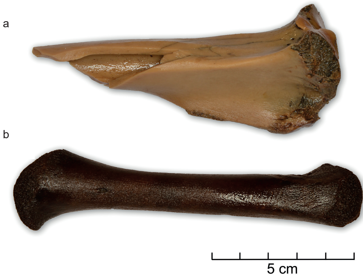
Figure 1. Two of the sampled specimens show the different, but generally good preservation conditions (a: MLF00906-II X3691; b: MLF00939-I X3043).

lithic and, accordingly, the introduction of livestock. We use Zooarchaeology by Mass-Spectrometry (ZooMS) as a means of refining the species identification, as sheep, goat, and roe deer bones are often challenging to differentiate morphologically, especially when fragmented (Buckley et al. 2009; 2010).