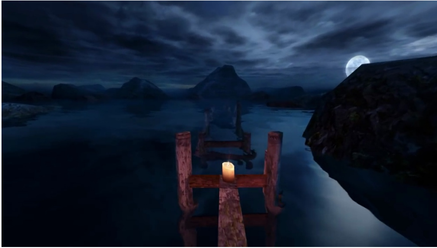
Fig. 2. A screen capture image of the game 'Dear Esther' (2012, Chinese Room).