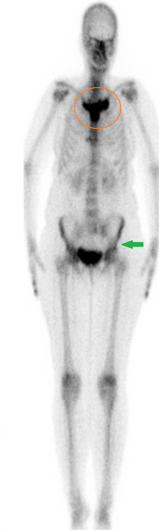
FIGURE 3: Whole body scan shows classical bullhead