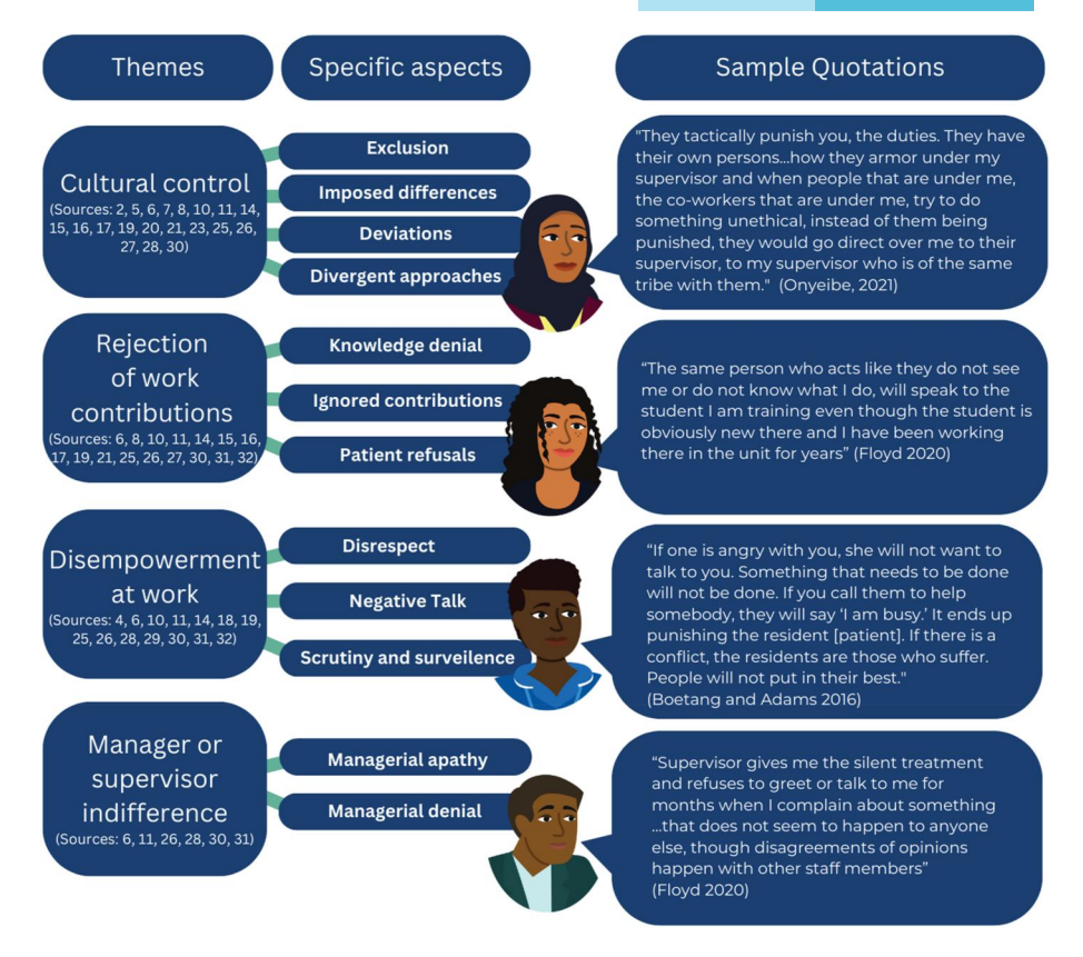
FIGURE 3 Example of racially minoritised hospital workers experiences of incivility.

questions, raising awareness of physical characteristics (e.g. hair), assigning patients related to an assumed similar identity, or witnessing derogatory remarks about people with a similar or the same identity (Supporting Information S5: 6, 8, 11, 15, 19, 21, 25, 26). Two articles (Supporting Information S5: 6 and 27) examined the work experiences of Jewish nurses and Turkish or Turkish heritage German inpatient geriatric staff, respectively, and reported pejorative comments directed towards religious minorities. The interview studies found that colleagues would ask inappropriate questions about their religion and expect staff to answer questions on behalf of a perceived homogenous negatively racialised or religious group.