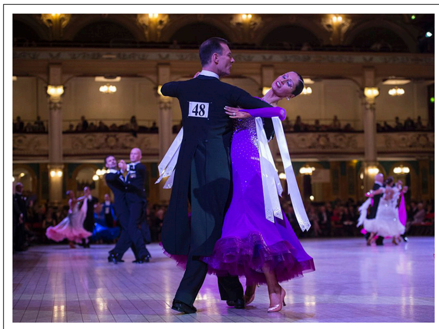
Figure 2. Standard dance couples in the 2016 British National Dance Championships. A male/female couple is in the foreground, and a male/male couple in the background

the use of photographs with recognisable individuals. Secondly, including some self-generated photographs transcended the need to request for permission from photographers to reproduce photographs for research purposes. Editorial permissions were acquired from Getty Images for other photographs. Thirdly, including self-generated photography opened myself up to multiple