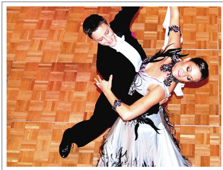
Figure 3. A female/female ballroom dance couple in film Hot to Trot

Ryan compares the performance of these dancers to the classical dance form to suggest that they are emulating traditional forms of masculinity and femininity. What troubled Ryan's association of this couple with the traditional is the sex of the dancers and his personal knowledge of them as a female/female partnership. This troubling of the perceptibly traditional led Ryan to further reflect on and unpick the concept of masculinity, in the process decoupling sex from masculine presentation and suggesting that gender and sexuality can also inform different approaches to the materialisation of masculinity. Ryan's interesting elaboration prompted me to pursue more in-depth questioning throughout the interview about particular characteristics he considered to be traditional forms