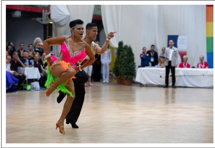
Figure 5. Couple in the Men's Latin dance category in the 10th Gay Games in Paris performing a Jive

in the equality dance community during and beyond the interview, into the data analysis and reporting phases. During the interview, I sometimes found it challenging to further explore the source of negative comments when these were explicitly made of known individuals in the photographs. Whilst feeling the need to identify the reasons behind these value judgements, I also felt it inappropriate to speak negatively about other dancers without their knowledge and within a research context. This conflict between my desire to question the emotions around negative comments and the ethics of engaging participants in negative talk of known individuals made photo elicitation difficult as an insider researcher. Apart from the interview event, finding a balance between eliminating negative comments in reporting and achieving an accurate, unbiased representation of participants' opinions was not an easy feat. For example, a negative comment was made about the costuming choice of an individual in a selected photograph: