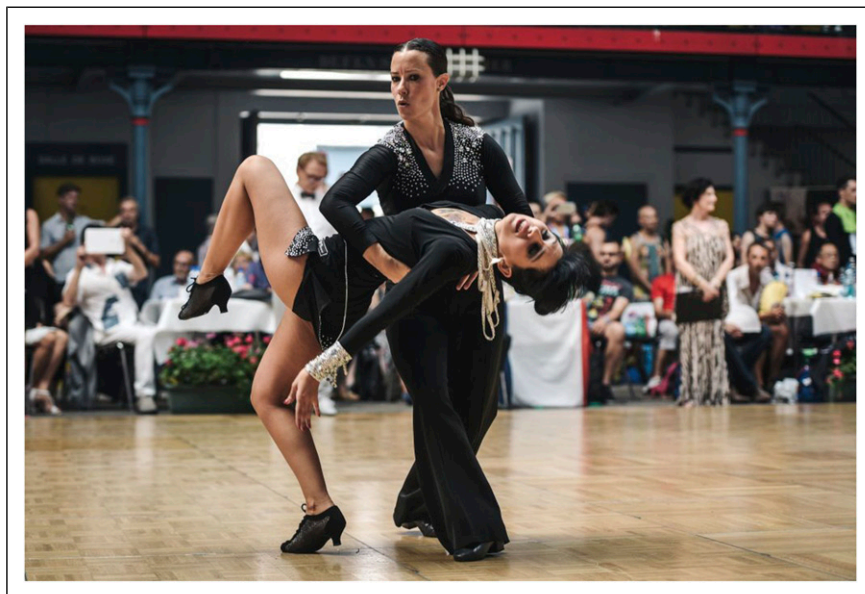
Figure 1. A couple in the Women's Latin category of the 10th Gay Games in Paris performing a dip