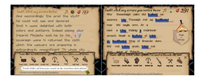
Fig. 1. Screenshots of Cipher in stage 0 and stage 1.

The Cipher game was adapted for Irish language learning by incorporating Irish language resources from textbooks and corpora [21]. Challenges arose due to the scarcity of Irish language resources such as suitable texts and lists of common errors for young learners. An initial list of common errors was assembled manually. A customised error noticing mechanism was developed to assist players in understanding and correcting errors which were randomly inserted into the texts. This version of the game targeted primary school students at A1-B1 CEFR levels. Initial feedback from an Irish-medium primary school highlighted the need for clearer instructions on how to play the game and the identification of real-world errors. Fig.1 displays a screenshot of Cipher in stage 0 (left) and stage 1 (right).