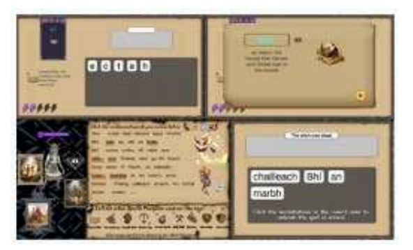
Fig. 5. Screenshots of Cipher in stage 4

The iterative development process, informed by pedagogical considerations, user feedback, and technological advancements, has enhanced Cipher as a game that balances educational value with engaging gameplay, particularly for less-resourced languages and varied learner needs. Through its evolution, modifications were made to enhance language learning and game experience, with particular emphasis on incorporating AI technologies, gamified elements, addressing the diverse needs of learners.