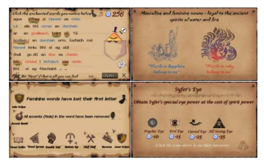
Fig. 2. Screenshots of Cipher in stage 2

The game was tested in an English-medium school, focussing mainly on user experience [24]. Feedback showed that players liked the game but some found the texts and the ciphers difficult, and many found the free-form story completion element too challenging. Clearly, more support was needed for early-stage Irish learners. With this in mind we explored the potential of AI image generation to create context-specific visual aids to enhance learners' comprehension and engagement.