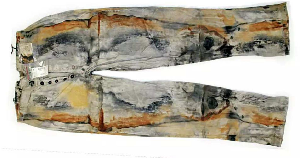
Figure 2: Denim pants recovered from the SS Central America, which capsized in 1857.

In a composting study by Cornell University published in 2024, a variety of denim fabric samples were tested with many of the samples substantially degraded in less than three months (Alwala, 2024). Similar materials, in this case denim, will not biodegrade in the same manner in all environments. This is likely one of the reasons why fragments from natural fibers are commonly detected in oceans around the world. Among the issues, marine environments often lack key nutrients, such as iron, making environmental conditions challenging for microorganisms.