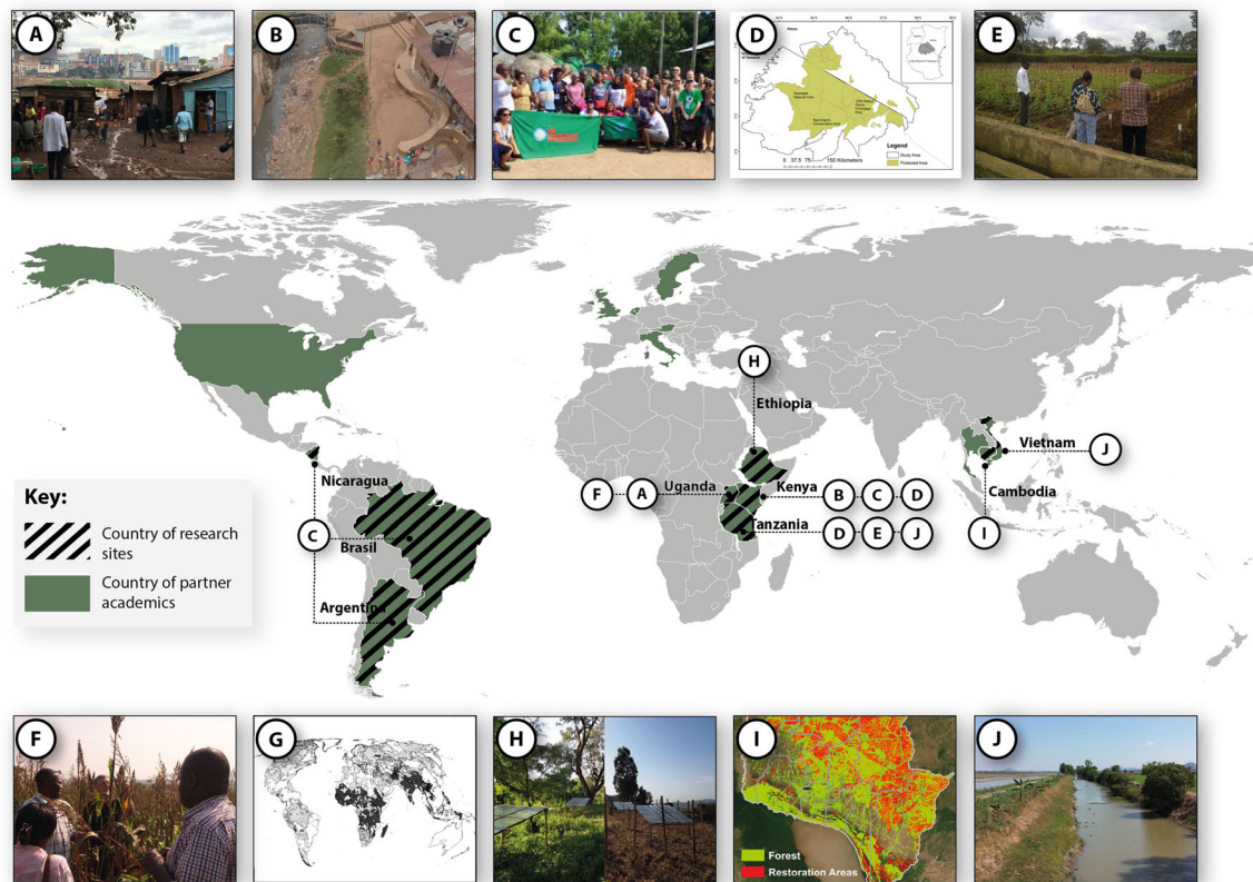
Fig. 2 Research sites and countries where partner academics research. Images selected to visualize geographical scale of research projects. Photo credits: the authors. The authors give permission to use the photos

development, as exemplified by the Brundtland definition and its emphasis on the tradeoffs between the needs of current and future generations (UNWCED 1987). Choices made today have consequences that last for decades,