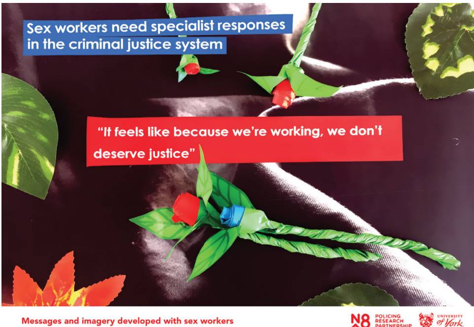
Fig. 3 Key message image co-created with sex workers—It feels like we don’t deserve justice

Notably, punitive outcomes had not substantially diminished alongside long-term implementation of the SWLO role. During our fieldwork in 2019, monthly local council bulletins for 6 months in 2019 (Jan-Jun) showed street-based sex workers routinely fined and arrested, with 54 official warnings issued, 18 arrests, 7 12 Home Office Cautions, 19 ‘house closures’ (evictions) using ASB powers and 30 male purchasers arrested/formally warned. In wider discussion about policing vulnerability, the question of whether sex workers get justice led to some unequivocal responses: ‘Do we fuck. We’re the last ones to get justice, because of what we do’ (arts workshop discussion). One of the three key messages developed through arts workshops (see Figure 3) underlined the shortcomings of the role in terms of the wider justice gap experienced by sex workers.