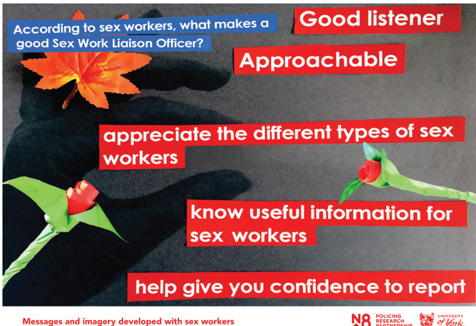
Fig. 1 Key message image co-created with sex workers—What makes a good SWLO

Key informants emphasized how the SWLO helped address vulnerability as part of the rising safeguarding agenda: ‘[vulnerability]’s a massive thing these days, and sex workers are almost like that group who are not usually spoke up about’ (Police Community Support Officer [PCSO]). SWLOs were considered as specialist vulnerability roles which now formed a core function of policing, a view shared by police partners as well as police. As one local support worker stated: ‘protecting the vulnerable is the very heart of any police officer’s job’. The SWLO invested considerable effort in building relationships of trust with the sex work community. The success of her role centred on sex workers perceiving her as authentic, consistently present and trustworthy, factors that other researchers have noted as essential in similar policing positions ( Johansen 2024 ); arguably making her a different kind of police officer to more traditional roles, with compassion and empathy central to her work ( Bacon 2022 ).