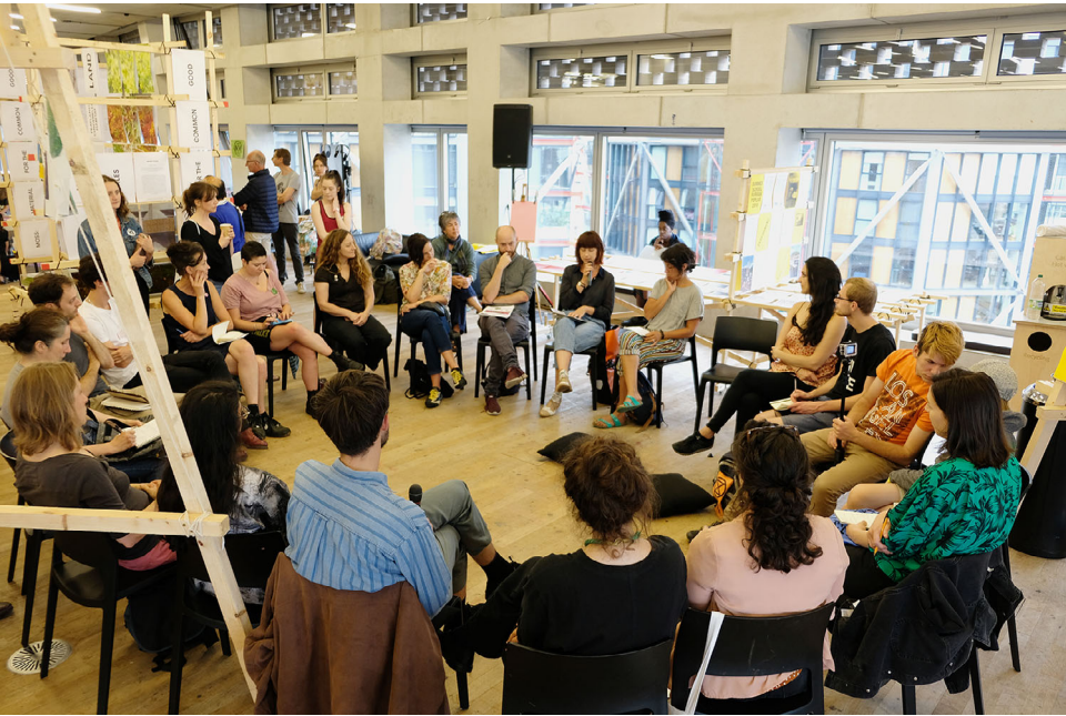
Figure 8: Trans-local learning exchange