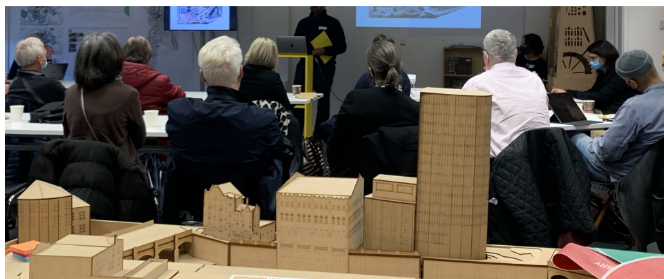
Figure 3: Co-production workshop—hosting the Castlegate Partnership at Live Works, 2021

and honest discussion between the community of practice and the local authority regarding governance and transparency in the delivery of the project.