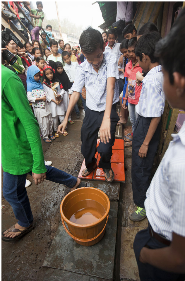
Figure 6: Community of practice—the children publicly demonstrate their design for a new gutter cover made from tin by the settlement tin box maker, during the final project presentations, 2016

pedagogy in alternative fields and institutions; while the NGO offered essential support for the research through local knowledge sharing, meetings, staff and volunteer time, and spatial resources. NGOs working in informal settlements in India often host foreign visitors for short-term projects, leading to expectations of the motivations driving these types of engagement and their duration. In this context, the project was expected to be short-term; but over six years the research grew incrementally (and continues today) in part to counter the colonial impacts of short-term engagement, always supported by the NGO founders and directors who believe that “ideally a school should be part of the community, with interaction back and forth” (2014). It culminated with workshops being assessed as part of the curriculum, moving towards pedagogic formality as a means of building legitimacy. An open-source toolkit was also developed with the school to attempt