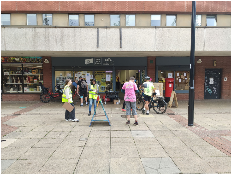
Figure 1: Live Works Urban Room hosting a community takeover, 2019

in the neighbourhood of Castlegate following Sheffield City Council's (SCC) decision to demolish and move the city's market. Following demolition, Castlegate as a centre for social life was replaced by marginalised cultural enterprise and local artists in the beginnings of an all too familiar urban regeneration strategy. Initially engaging as a means to develop co-produced visions for the future of Castlegate, after six years of advocating for citizen voices, Live Works were funded by SCC to deliver a co-production strategy, placing the organisation in a position of complicity and accountability with the ongoing urban development process.