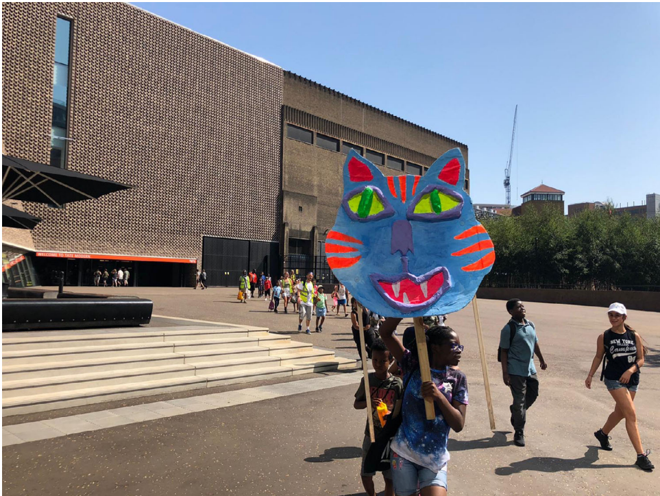
Figure 7: Assembling the School for Civic Action at Tate Modern

The case focuses on two curriculum moments (2018 and 2019) as part of the Tate Exchange programme in London, which the author convened and co-curated, during which the SCA mobilised their network of collaborators to “transform Tate Exchange into a public classroom, bringing together activists and practitioners engaged in civic movements, prototyping a collective education platform for civic action”. This platform was collectively programmed by SCA partners, involving 20+ arts/culture organisations, four universities, 10+ grassroots organisations, and hundreds of drop-in participants, who recognised the need for “spaces of collaboration outside community centres or universities” (Figure 7).