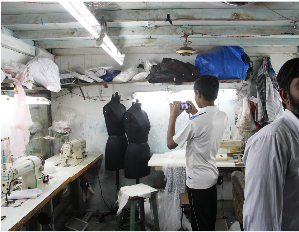
Figure 4: Radical classroom—one of the schoolchildren documents a tailor’s workshop during a craft audit in the settlement, 2015

my community” (2015). Alliances were created with the commissioning of settlement craftspeople (tin box makers, embroiderers, tailors, and bag makers), highlighting the potential of (informal) craft as a civic pedagogical tool, one that could give agency to both the craftspeople and the children. Although at first they were uncertain about the commission, the craftspeople said that “we are very happy to be supporting the children’s [learning]” (2015), that it was the first time they had been invited into a school to share their knowledge, and that they were enthusiastic in their engagement with the pupils’ neighbourhood designs. The children visited the settlement, and the craftspeople visited the school, to enable design discussions, encouraging understanding between the school and the neighbourhood. Pedagogically speculative (unplanned and opportunistic), the project required risk to be taken by the school, negotiated by the researcher and the school administration, testing institutional structures (with requirements of timetables, consents, curricula, and grades) while identifying the potential for unlearning and positive change through public engagement with the settlement as a radical classroom (Figure 5).