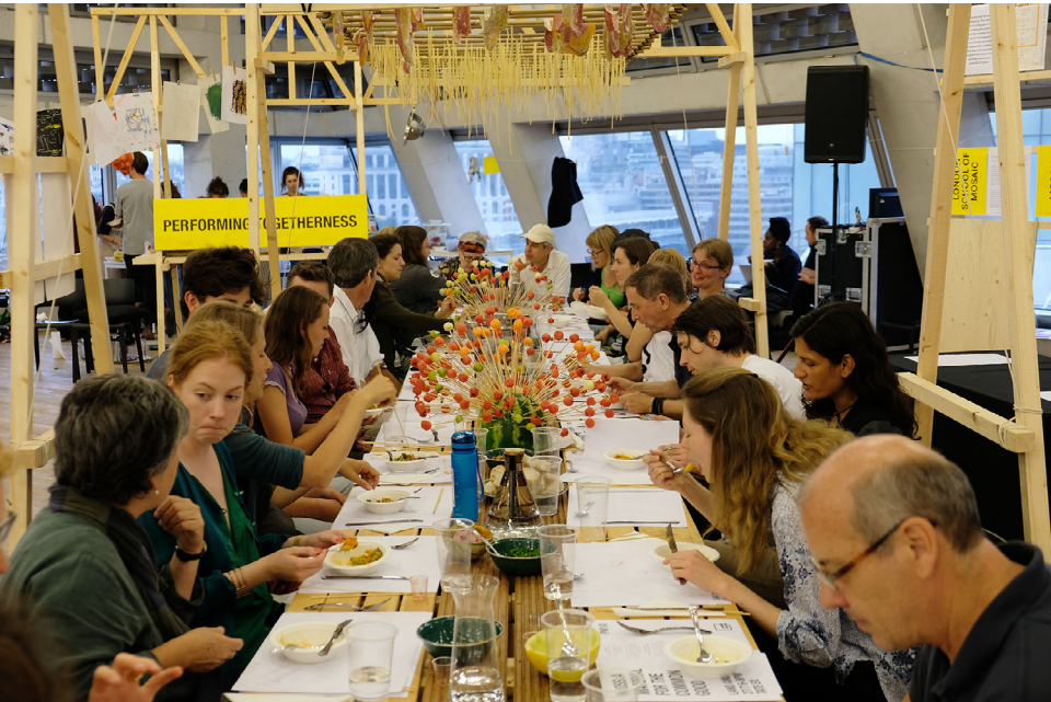
Figure 9: Discursive dinner as performative learning

nature-based solutions to air pollution. These performative learning methods play an important role in the pedagogy, bringing together previously disconnected groups and individuals despite mutual interest, and providing a public