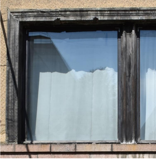
Fig 2: Detail of Central Post Office 1930-1932