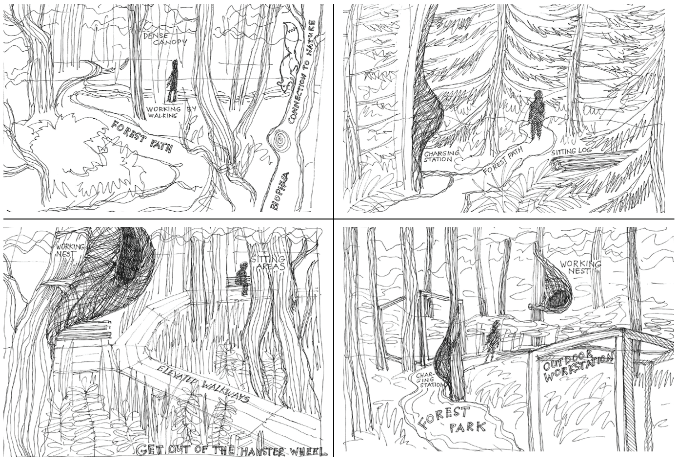
Fig. 2. Conceptual sketches of FO-AM spaces [Figure: Authors of the Article].

the original FO-AM, the nearly wild or wild forest, surrounds the previous structures (Figs. 1 and 2).