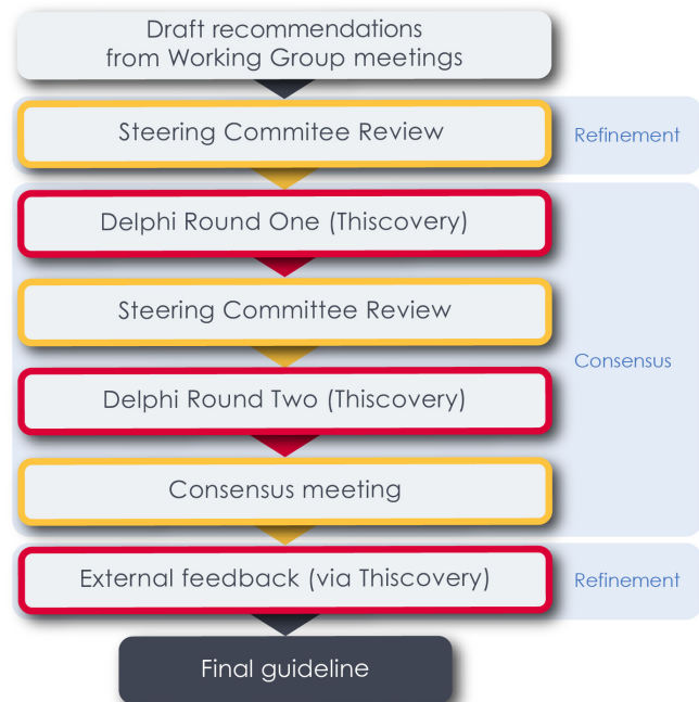
Figure 2. Translating draft recommendations from working groups into a final clinical practice guideline. Draft statements from working group meetings will be prioritised for inclusion in final guideline through an online Delphi consensus-building exercise, selection and finalisation by the ICENI steering group (yellow boxes), and a subsequent feedback and refinement on implementation and feasibility from external stakeholders. Red boxes indicate use of the Thiscovery platform.

Draft recommendations will then be subjected to a two-step process of refinement before being considered as part of a formal consensus process (Figure 2). The first of these stages will be a review of each recommendation and its evidence by the steering committee, mainly focused on ensuring that each recommendation is within the scope of the process