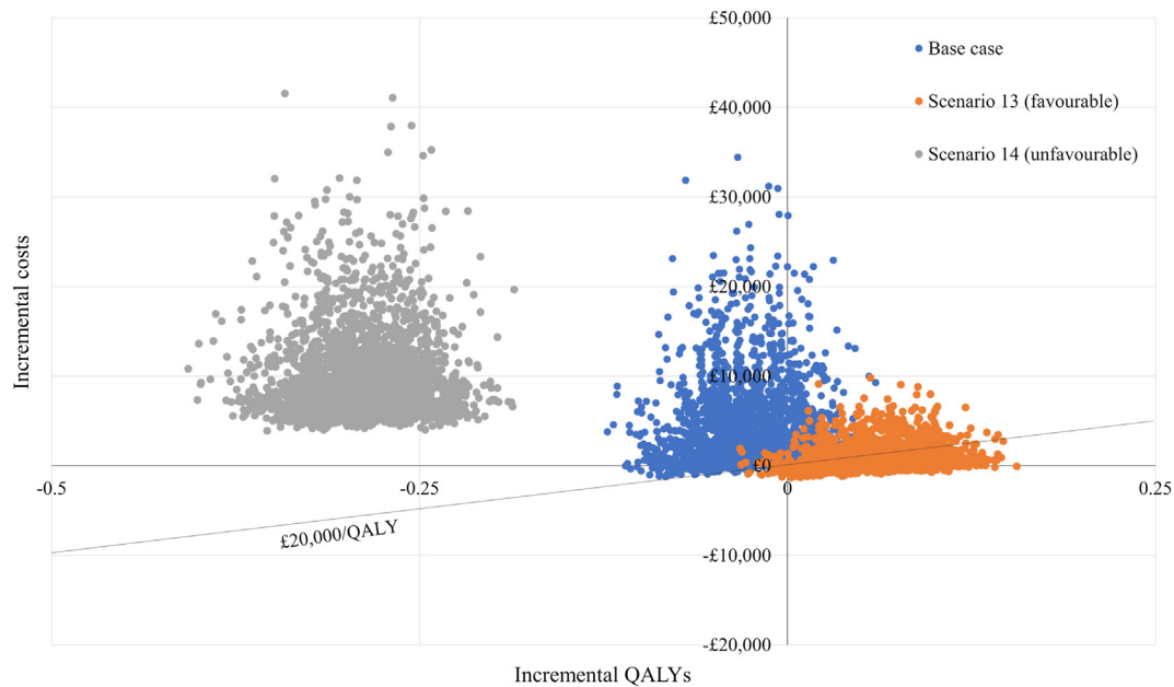
Figure 2. Cost-effectiveness plane: base case, Scenario 13, and Scenario 14.

QALY indicates quality-adjusted life-year.