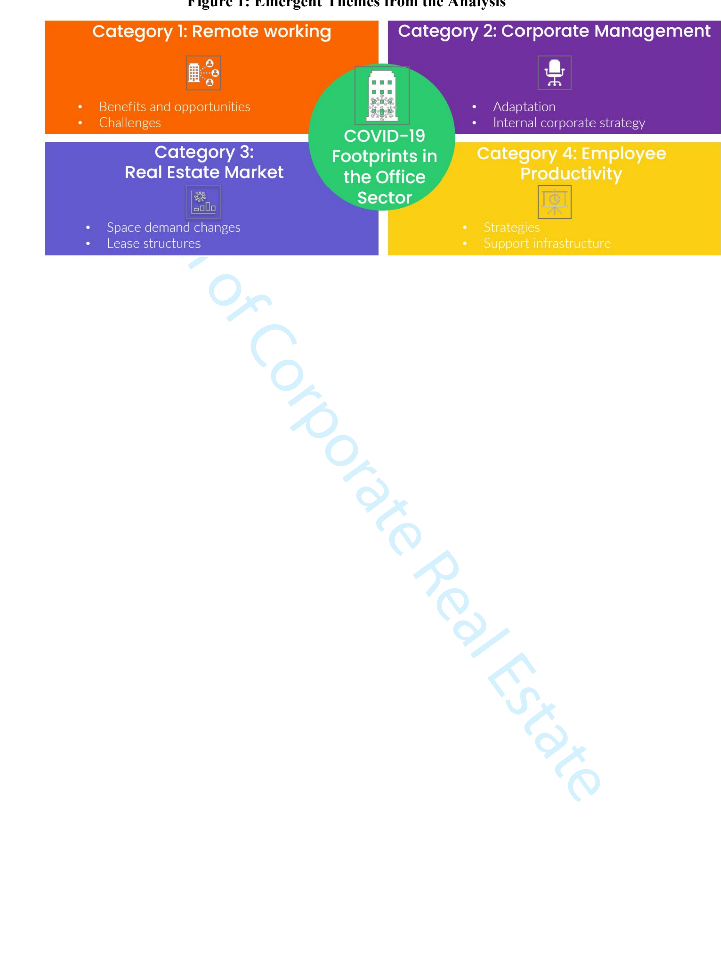
Figure 1: Emergent Themes from the Analysis