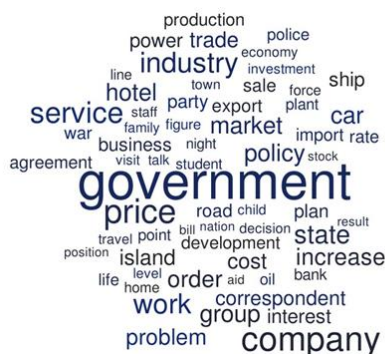
Figure 2. Summary of the most frequent terms in the British dataset.

The British articles diachronically focus on the Greek economic scene and the debates are quite consistent around governmental policy. There is preoccupation with Greece's investment in infrastructure, both public and private, with particular emphasis placed on the building of new hotels, roads and beaches. Also great attention is paid to the economic impact of the tourist industry and its dependency on international developments.