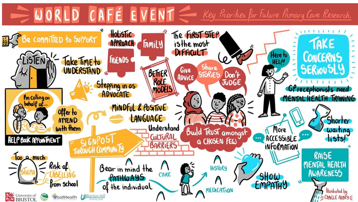
Fig. 1 A visual illustration of notes from World Café 1