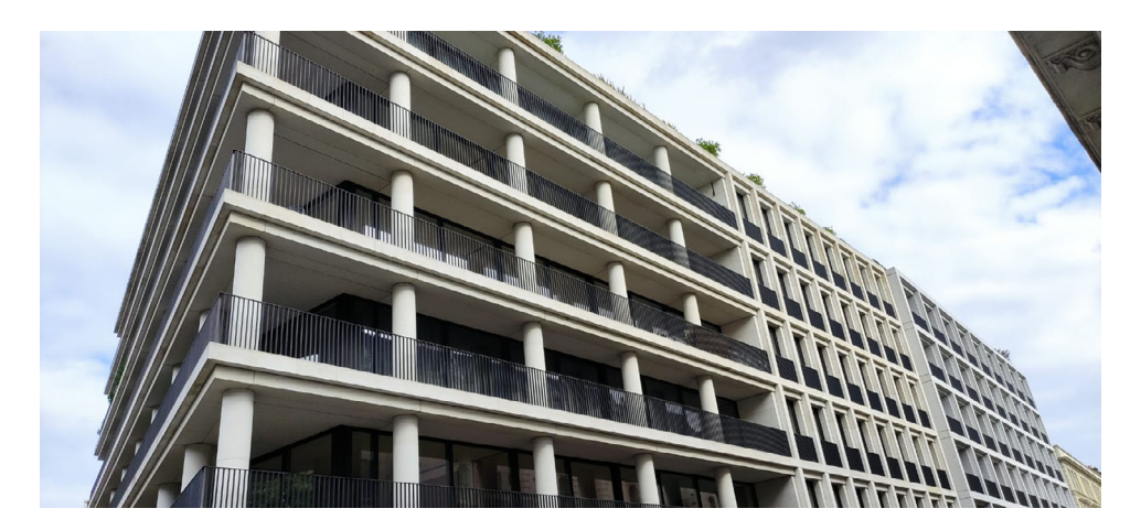
Figure 1: One Kensington Gardens