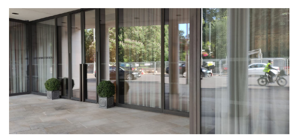
Figure 3: Reflective windows give the appearance one is being watched