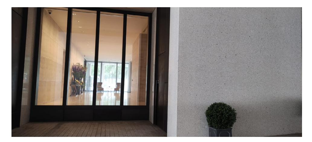
Figure 4: The dormant reception area

stayed on Knight Frank's website for at least three years). I found that the property is one of 6,000 buildings in Kensington and Chelsea that is registered in an offshore tax haven—more specifically the British Virgin Islands (WOE 2021). But finding out who lived here was not the intention of my research. Residents in Kensington refer to One Kensington Gardens when talking about empty homes, land banking, and the planning decisions made by the council. I use One Kensington Gardens as my centrepiece in which to consider the many ways empty homes owned by the megarich result in buy-to-leave gentrification.