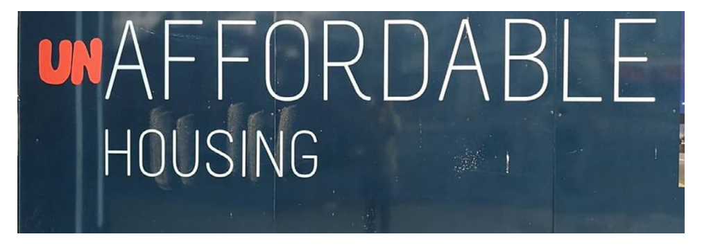
Figure 6: UN-affordable housing board outside the former Odeon Kensington Cinema, 2019