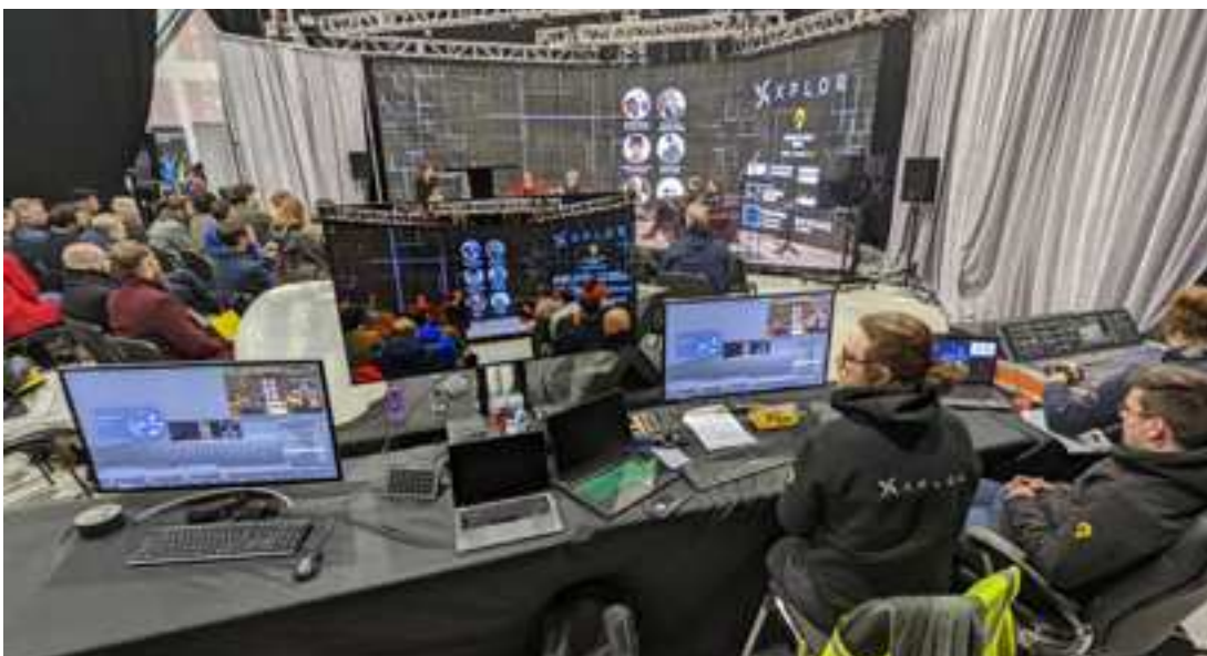
Image 1 - Production Park/Xplor's 'brain bar' and LED volume

We also attended two industry events which had a focus on virtual production. Following in person networking at these events, follow up emails were sent to the companies and individuals who had been approached during the shows. From these two recruitment strategies, we then snowball sampled additional participants.