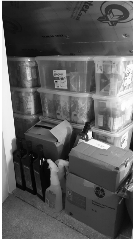
Figure 2. Storage containers in eaves full of rice, pasta, olive oil and cleaning products.

What I'm doing all takes time . . . from the effort I put into it, it costs, all my energies, it's vast. You've got to think what do we eat, on a day-to-day basis, what do we eat, how much of everything, for how long? Is one month enough, is six months? I've gone for the six months scenario, just to be safe. Right down to toothpaste, shampoos and toilet paper, you can't forget the toilet paper, making an inventory of what we go through and use . . . it becomes all-encompassing and there's always the sense of do I need more? So, I go out and get more. I don't mind it though, I know I could usefully spend my free time doing other things, seeing friends, reading a book, but that's not what motherhood is about, is it? I'm doing it because that's what mums do, for the good of their kids.