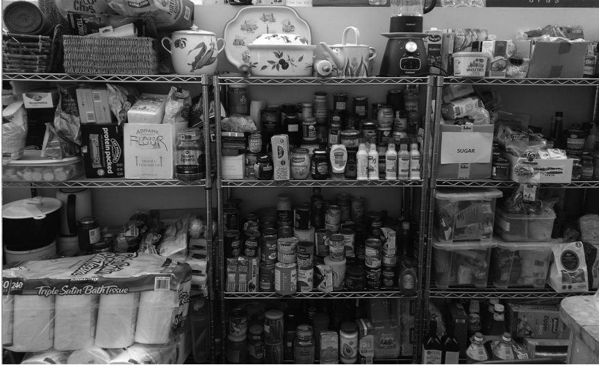
Figure 1. Purpose built storage area.

because we have no food? Are people going to think that I'm not coping?' Sarah's concerns regarding the imagined future consequences of not meeting expectations is reflective of the motherhood display literature (Dermott and Seymour, 2011; Finch, 2007). Being seen by others, particularly other women, as a 'good' mother was important for our participants, yet their prepping activities remained highly secretive and guarded.