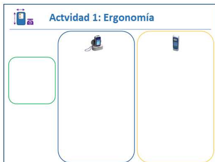
Figure 4. An example of one of the sticky cards representing the topics predefined for activity 2.