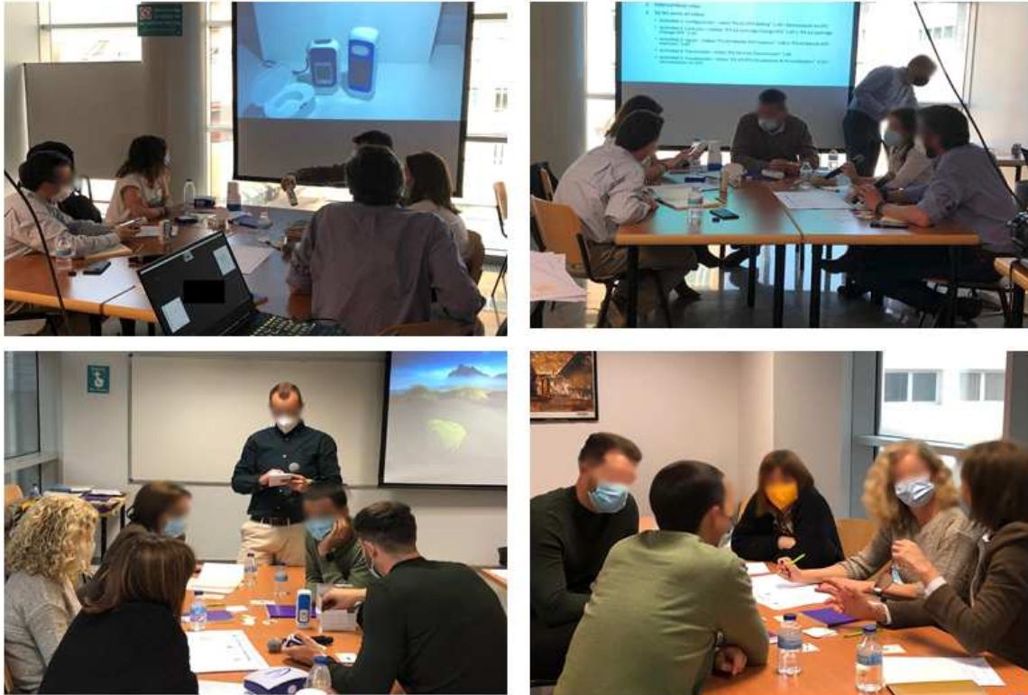
Figure 1. Photos of participants taken during the workshop sessions.

endocrinologists; n=2, 20% nurses; and n=2, 20% pharmacists), with the workshop lasting 3 hours (Figure 1). Several predefined questions designed based on perceived usefulness and perceived ease of use were discussed during the workshop session.