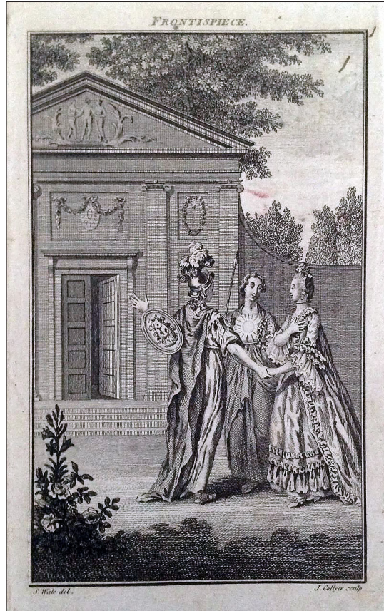
FIG. 1. FRONTISPIECE TO THE LADY'S MAGAZINE FOR 1774.

The 1789 frontispiece epitomises the magazine's self-conceptualisation as a publication uniting the values of female propriety with a projected (pre-Wollstonecraftian) 'revolution in female manners' that would see its female readers and contributors striving to 'excell [ sic ] each other' as much in mental accomplishments ('scientific studies') as much as 'formerly' they did 'in the trifling of dress, and in the arts of dissipation'. 22 This was an ambitious project that the magazine attempted to realise through various mechanisms: the space it gave to the question of women's education and extracts from educational works in the