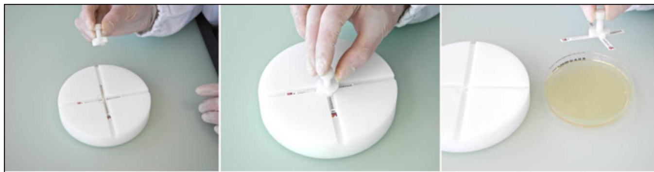
Fig. 1. MTS™ synergy applicator platform plus MTS antibiotic strips [19].

An MTS of fosfomycin was placed with tweezers on to the MTS synergy applicator platform, such that the MIC value for fosfomycin (tested alone) was positioned at the base intersection (see Fig. 1 below). An MTS of antibiotic 'B' (the partner antibiotic) was then carefully placed on to the MTS synergy applicator platform, such that the MIC value of antibiotic 'B' was positioned at the base insertion at a 90° angle to the fosfomycin MTS in a 'cross' formation. The MTS synergy delivery tool was used to move the appropriately positioned MTS 'cross' onto an inoculated agar plate. The MTS synergy delivery tool was then removed, ensuring MTS strips were pushed onto the agar surface with tweezers as required. Plates were then incubated for 24h. All synergy tests were photographed for future third-party reference/re-interpretation as needed.