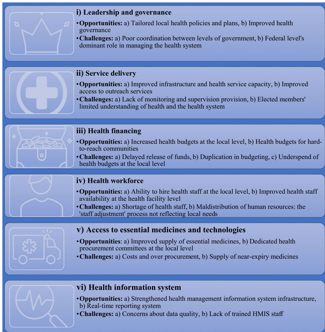
Fig. 2 Opportunities and challenges facing the federalised health system in Nepal