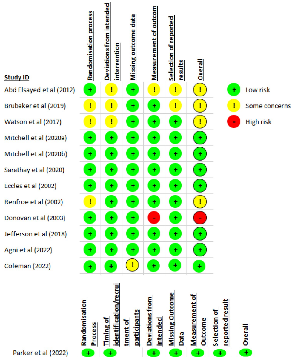
Fig 2. Risk of bias assessment of included RCTs.

https://doi.org/10.1371/journal.pone.0288028.g002