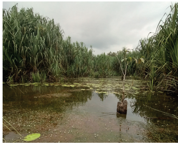
Figure 4. Collection site of the presently reported Mastacembelus notophthalmus (AMNH0007); slow water flow and abundant water plants on the river, Lenggang River, in East Belitung District, Belitung Island, Indonesia.

Meristic and morphometric characters of the M. notophthalmus specimen from Belitung Island are presented in Table 1. These meristic features also support the identification of the species as M. notophthalmus .