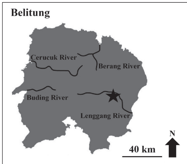
Figure 3. The presently reported collection site of Mastacembelus notophthalmus on the Lenggang River in East Belitung District, Bangka Island, Indonesia.