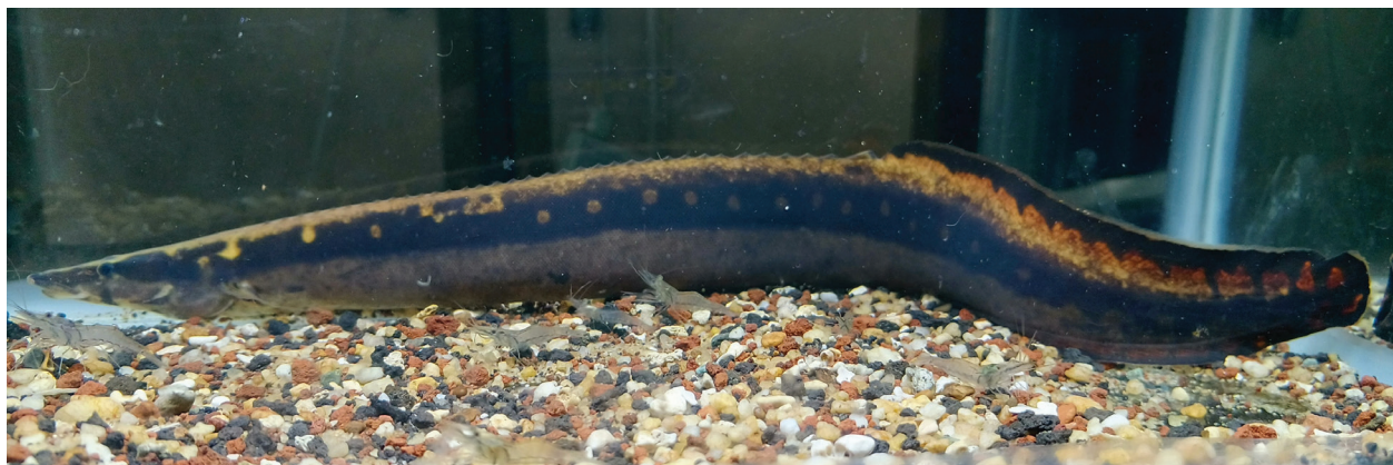
Figure 1. Live specimen of Mastacembelus notophthalmus from the Lenggang River, East Belitung District, Belitung Island, Indonesia, 410.5 mm SL (AMNH0007).