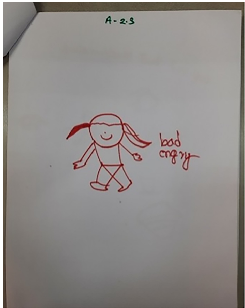
Fig 1. 'Bad angry' (CB4). Adding descriptors to explain drawings. Note that the descriptions of the emotion do not clearly match the faces of the drawn figures.

https://doi.org/10.1371/journal.pgph.0001194.g001