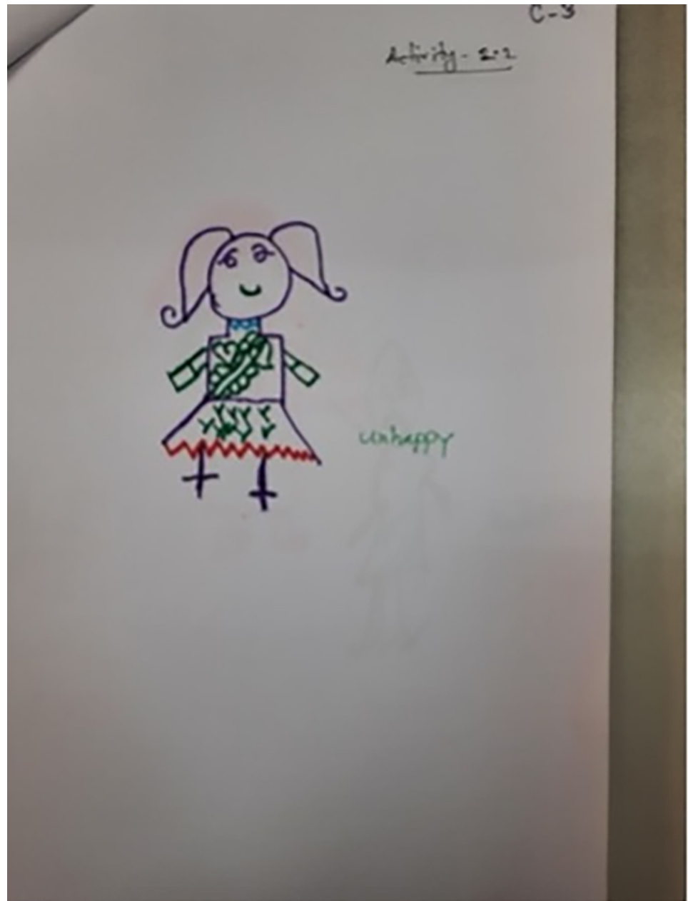
Fig 3. 'Unhappy' (CB8). Adding descriptors to explain drawings. Note that the descriptions of the emotion do not clearly match the faces of the drawn figures.

https://doi.org/10.1371/journal.pgph.0001194.g003