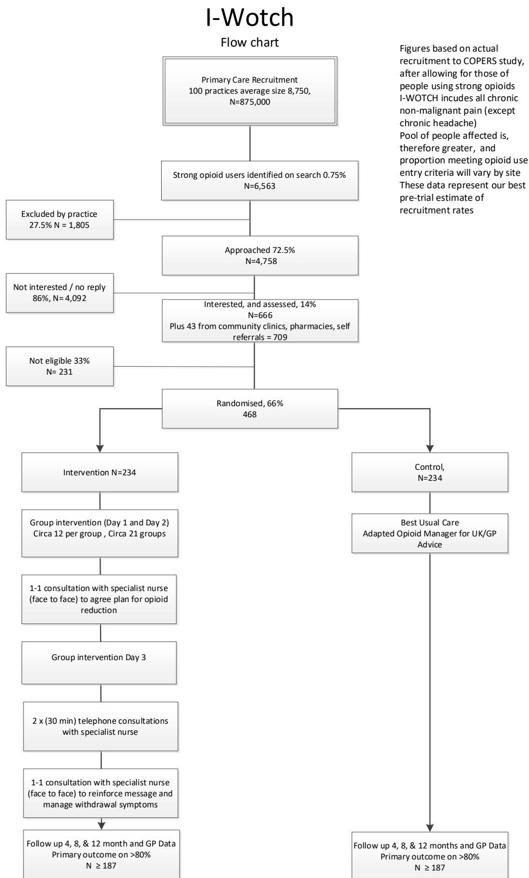
Figure 1: Recruitment flow diagram (original estimates based on the COPERS study)