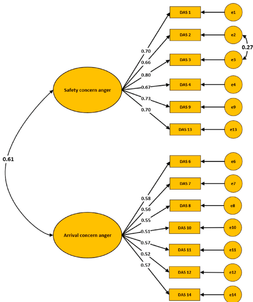
Fig. 2. 13 items with two factors of the Driving Anger Scale (DAS).

equal and greater than 15 [55]. After modification, all items' loading values were over 0.50, thus 13 items with two factors DAS were determined, respectively called "Safety Concern anger (SC)" and "Arrival Concern anger (AC)", they were significantly and moderately associated ( r = 0.61 , See Fig. 2). SC refers to the driving anger situations threatening drivers' safety, e.g., item 3, "Someone backs right out in front of you without looking". AC includes driving context associated with drivers' arrival blocking, e.g., item 7, "Someone is