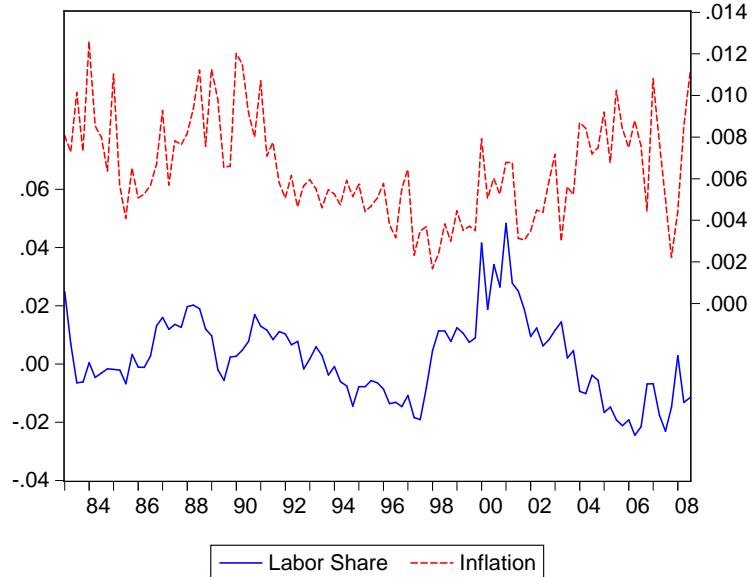
Figure 2: Labor Share and Inflation in the US, 1983Q1–2008Q3.

disinflation episode bringing inflation down from about 10 percent to 4 percent. Second, over the period 1979Q4 – 1982Q4, the operating procedures of the Federal Reserve involved targeting non-borrowed reserves as opposed to the Federal Funds rate. Thus, our empirical analysis focuses on the sample period 1983Q1 to 2008Q3, which spans the period starting after the disinflation and monetary policy shifts that occurred in the early 1980s and extends until the period when the interest rate zero lower bound becomes a binding constraint. 13 Figure 2 plots the time series of the US labor income share, s_t , and inflation for the sample period 1983Q1 to 2008Q3.