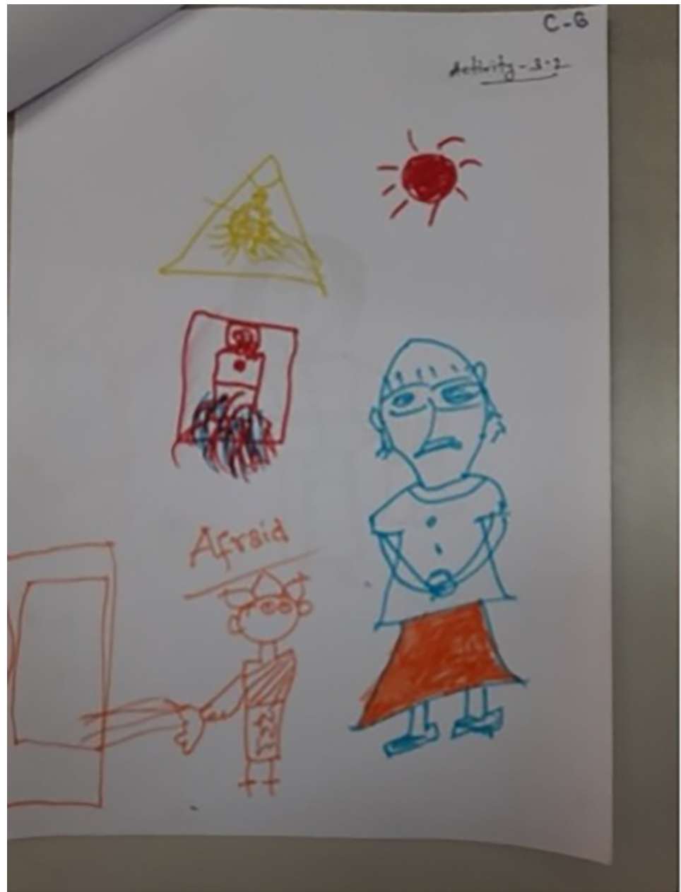
Fig 4. 'Afraid' (CB8). Adding descriptors to explain drawings. Note that the descriptions of the emotion do not clearly match the faces of the drawn figures.

https://doi.org/10.1371/journal.pgph.0001194.g004