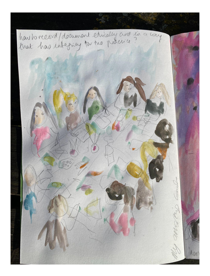
Figure 3: Pencil and watercolour sketch of the women around the table at maternal journal from Jessica's fieldnotes, 23 January 2023. My Amazing Hands' activity, Jessica's fieldnotes.

12 months) who are referred in to the programme by support services, including perinatal mental health expert midwives. Practitioners leading the journaling workshops include midwives, community arts practitioners and family support workers. There is a crèche for the babies/toddlers in an adjoining room and the focus is on the mothers themselves – in contrast to a mother [parent]-and-baby group, for example, for which the activity would often focus on the babies, or the babies with the parents. Each week involves a different activity, for example, poetry, collage, or automatic painting, all of which are drawn from a recently published book (Godfrey-Isaacs and MacGowan 2021) which includes activities from across creative fields, written and designed by practising creative practitioners from across artistic disciplines. The arts organisation leading the project is located in the building that