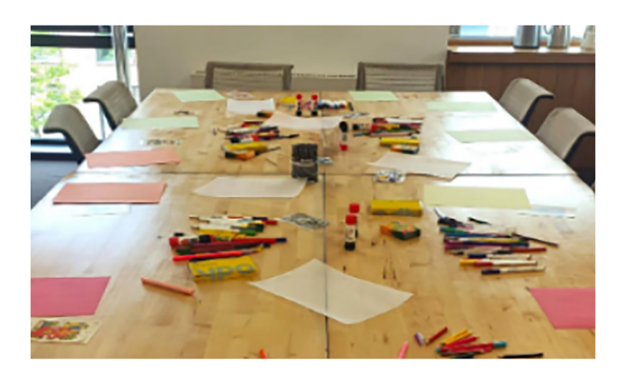
Figure 2: Table set out for maternal journal workshop with paper, pens and glue.

I focus here on the strand of the Connect project which engages particularly with everydayness: creative journaling for mothers and birthing parents (Godfrey-Isaacs and MacGowan 2021). This is a 10-week course for mothers (broadly and gender-inclusively defined – anyone who identifies as a mother can join, although in practice this has tended to be new mothers who have recently had babies in the last