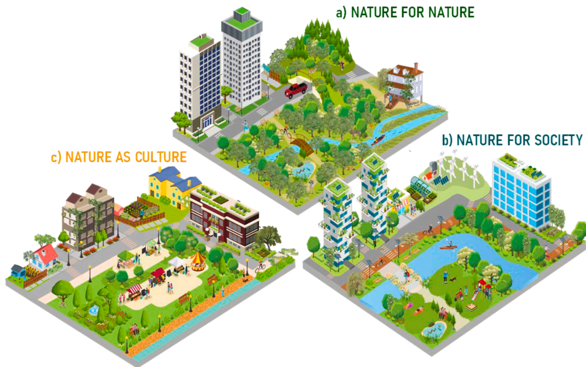
Fig. 2. Visual representations of the visions for each of the three Urban Nature Futures .

rivers as living systems, especially in the management and restoration of freshwater biodiversity and riparian buffer zones. Rewilding is promoted as a management strategy in large portions of the city parks, where soft management practices are implemented leading to an increase in the complexity of understory vegetation. Ecological corridors connect urban green areas to wider landscapes. Urban dwellers value nature intrinsically and experience wildlife through various activities such as bird watching and walks in the woods. There is education on biodiversity conservation, which in turn contributes to ecosystem protection and restoration. Housing and city infrastructure are designed to